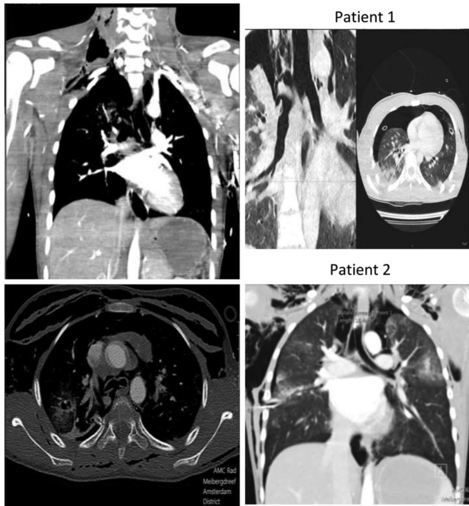
Figure 1: CT scan in the first patient, showing a lack of continuity between trachea and right main bronchus and bilateral lung contusions. CT scan in the second patient, showing an almost complete avulsion of the right main bronchus from the trachea.

ECMO circuit and antagonized by protamine afterwards. A posterior tear in LMB was directly sutured from the inside, after a careful inspection of both trachea and bronchi. RMB avulsion was repaired using a sliding technique because of the smaller size of airways.