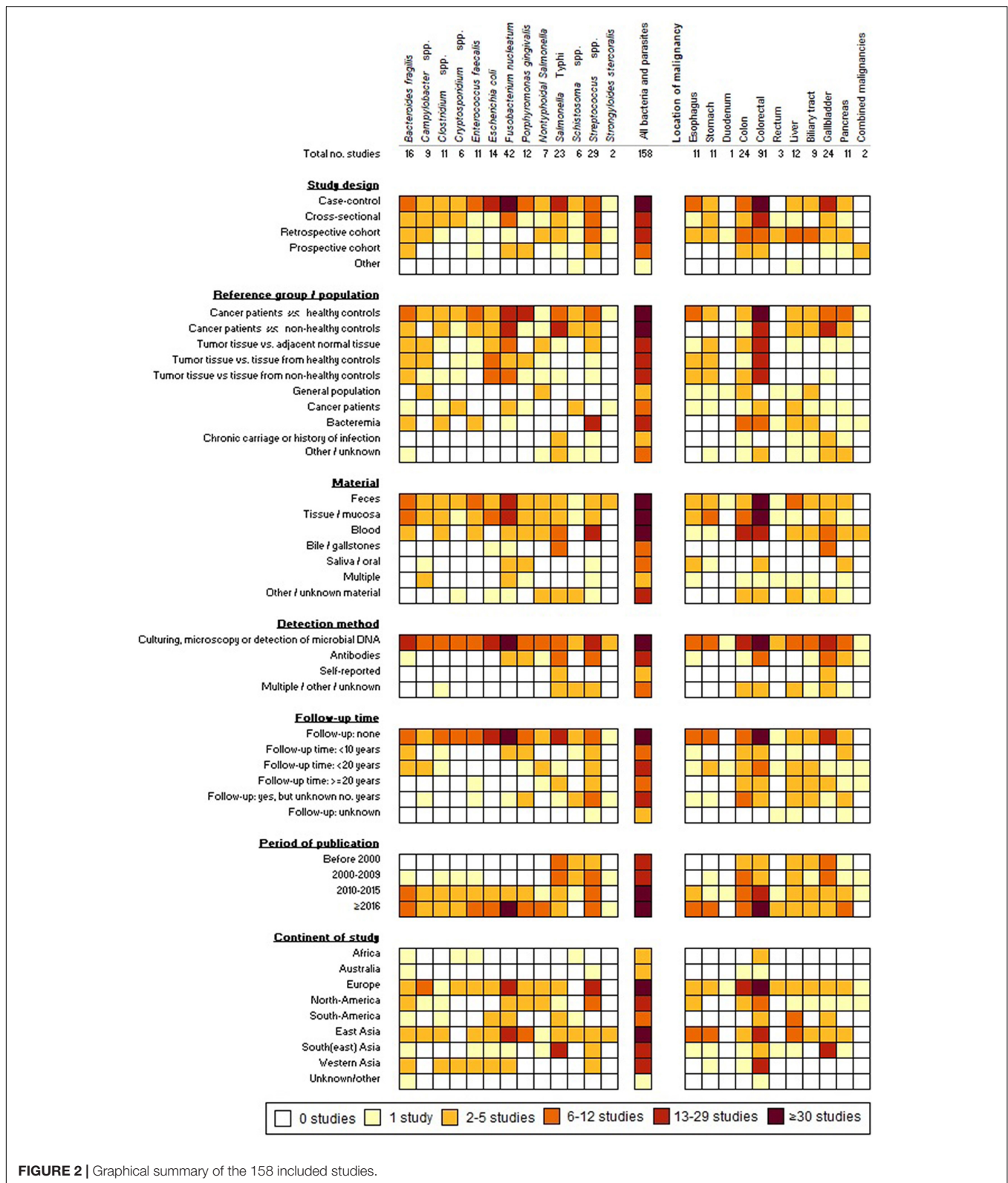
FIGURE 2 | Graphical summary of the 158 included studies.

(Sung et al., 2021). Moreover, the cancer inducing and/or promoting capacities sometimes differ between subtypes of the same microorganism, as suggested for E. coli , NTS, and