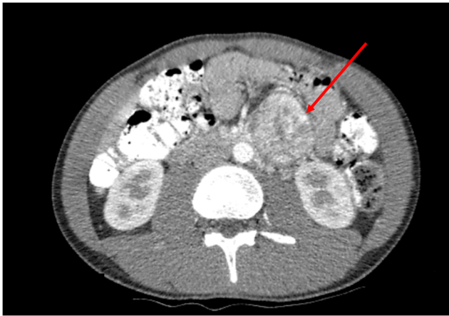
Fig. 1 Abdominal CT scan demonstrating a hypervascular para-aortic mass of 7 cm with central necrosis, located caudal to the left kidney

the patient was hypotensive, and alpha blockade could not be initiated. Therefore, the femur was immobilized, after which the patient was admitted to the ICU for respiratory support using optiflow and hemodynamic support. Echocardiography showed akinetic basal and mid-ventricular segments of the left ventricle, interpreted as inverted Takotsubo cardiomyopathy. Therapy with milrinone, a phosphodiesterase inhibitor, was started, after which hemodynamic stability was reached. In addition to milrinone, metyrosine was initiated to reduce catecholamine synthesis, resulting in further improvement of his clinical condition and recovery of systolic function on echocardiography. Milrinone was stopped and doxazosin started in anticipation of orthopedic surgery of his femoral bone, which was performed 32 days after the onset of the crisis.