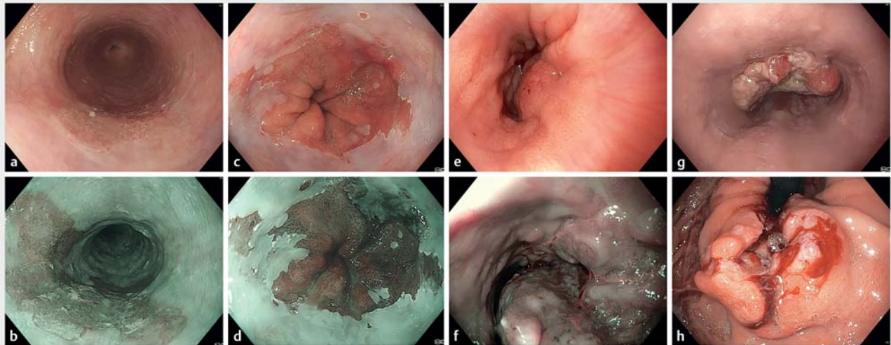
► Fig. 1 Endoscopic images of esophageal neoplasia showing: a, b early Paris type 0-IIb squamous cell cancer from the 4–10 o'clock position on: a white-light endoscopy (WLE); b narrow-band imaging (NBI); c, d early Paris type 0-IIa-IIb adenocarcinoma from the 12–4 o'clock position in a short segment Barrett's esophagus on: c WLE; d NBI; e, f advanced esophageal squamous cell cancer on: e WLE; f NBI; g, h advanced distal esophageal adenocarcinoma on: g antegrade view; h retroflexed view.