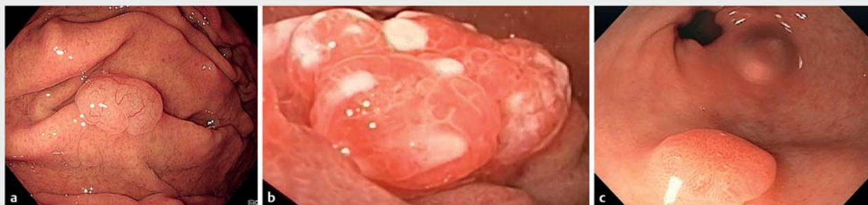
► Fig. 2 Endoscopic images of the various types of gastric polyps: a fundic gland polyp; b hyperplastic polyp; c gastric adenoma.