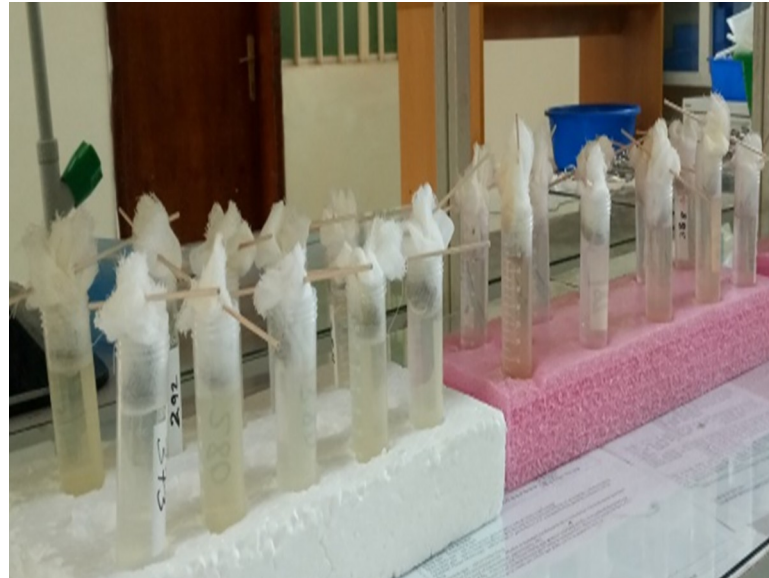
Fig 3. Suspension of stool samples in 50 mL tubes with lukewarm water.

https://doi.org/10.1371/journal.pntd.0009076.g003