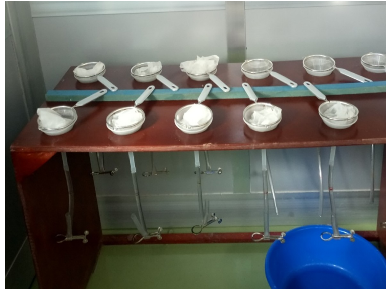
Fig 2. Funnel stand with Baermann apparatus for filtering of S. stercoralis larvae from stool samples.

https://doi.org/10.1371/journal.pntd.0009076.g002