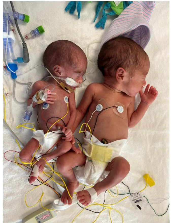
Fig. 1. A MC twin pair with sFGR born at a gestational age of 30 weeks with respective birth weights of 500 gs (left) and 1350 gs (right). The picture was taken ten days after birth.

These insights in a unique population of identical twins, press the pathophysiologic adverse effect of growth restriction on lung development.