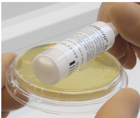
Figure 1 Ampoule surface sampling by contact plate.