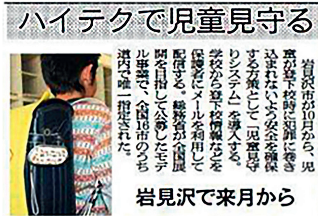
FIGURE 4 IC tag attached to the backpack of a child in Iwamizawa City