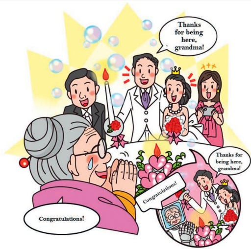
FIGURE 3 Chie attends her grandson's wedding as a robot

( ureshikatta うれしかった). These positive emotions are causally linked to the robot's role, impressing on the reader the idea that robot technology is good. Evidently, allowing devices complete access to one's personal life is a matter of allowing yourself and your family to be happy.