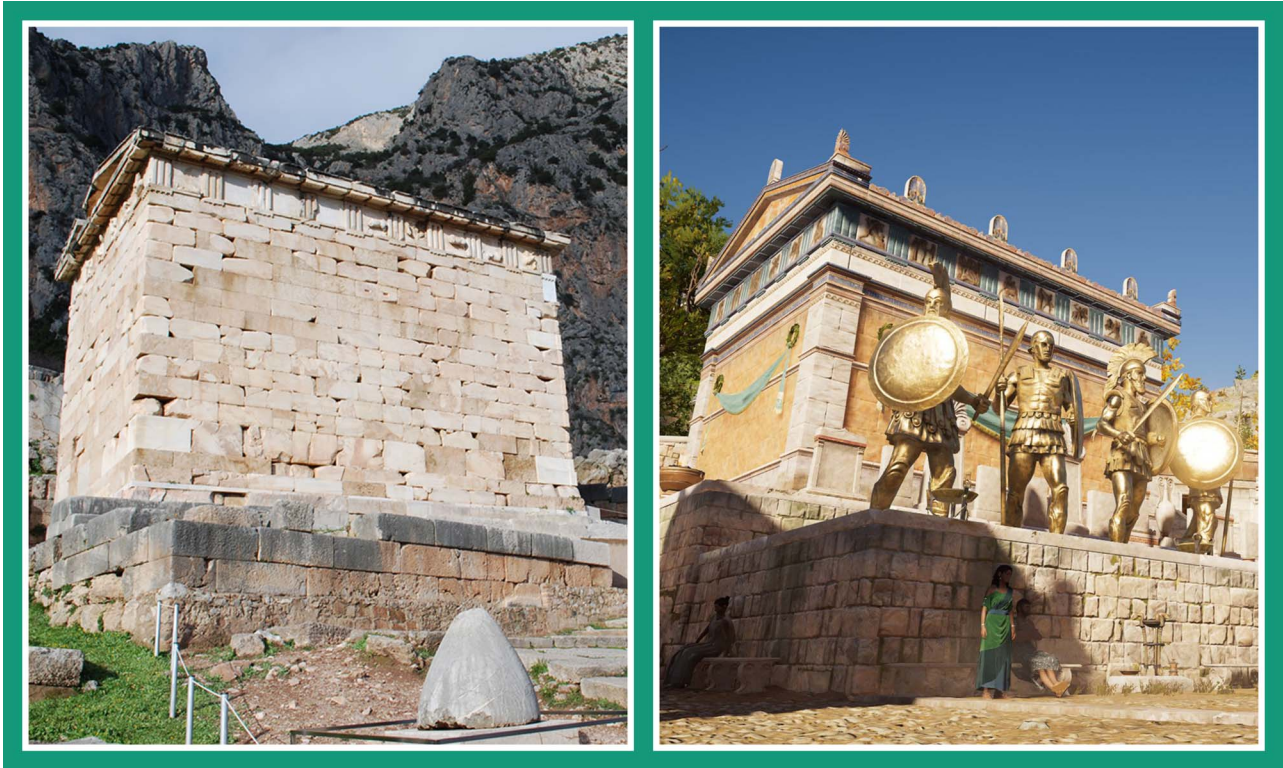
FIGURE 3. The Athenian Treasury at Delphi and the street leading up to the Temple and the same location in Assassin's Creed: Odyssey.