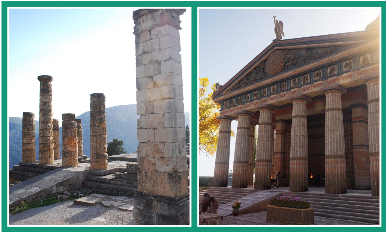
FIGURE 5. The remains of the sixth Temple of Apollo at Delphi (320 BCE; photo by A. Politopoulos) and the same location in Assassin's Creed: Odyssey showing the classical temple (525–373 BCE; screenshot by A. Politopoulos).

Euripides, and Aristophanes that unfolds during a symposium at the house of Pericles is one of the best moments in the game.