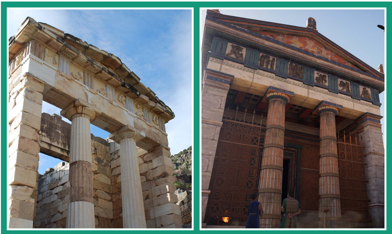
FIGURE 4. The front of the Athenian Treasury at Delphi and the same location in Assassin's Creed: Odyssey.