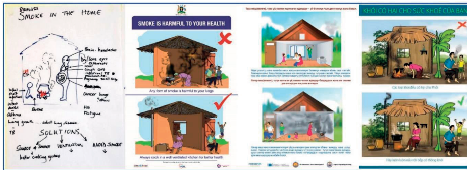
FIGURE 2: Development of the illustrations, from the first draft (left) to the final version used in Uganda, Kyrgyzstan and Vietnam. The illustrations show solutions to smoke exposure (use of improved stoves, improve ventilation by opening a window or installing a chimney, quit smoking, etc.). Illustrations were made by the art department of local universities.