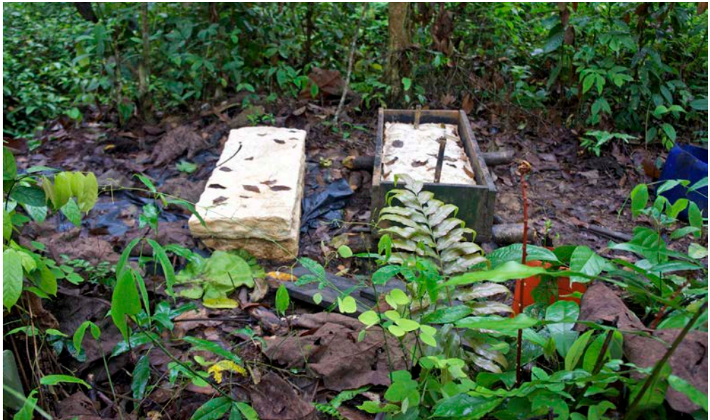
Figure 40. Rubber storage