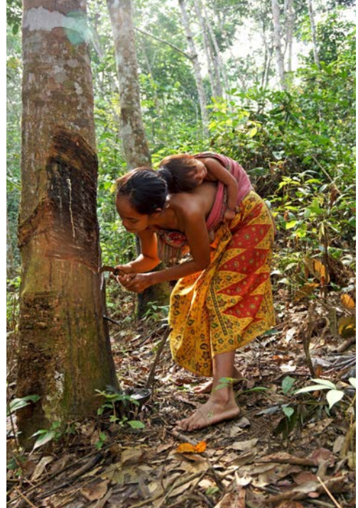
Figure 35. An Orang Rimba woman of the Sako Tulang group tapping rubber in her field while taking care of her child, 2013