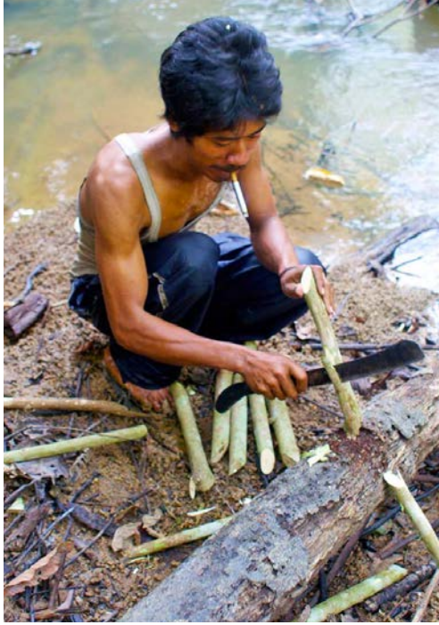
Figure 38. An Orang Rimba man prepares sticks to fix the fishing net in Makekal River, 2013