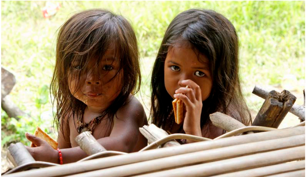
Figure 36. Children of Sako Tulang group eating snacks, 2013