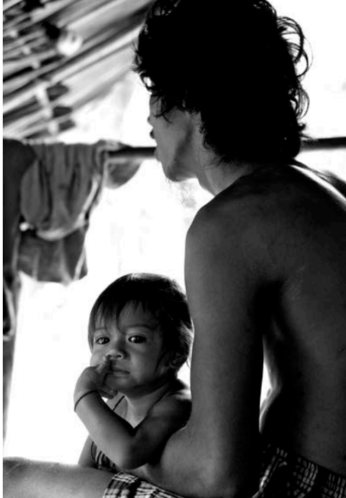
Figure 34. An Orang Rimba man is taking care of his son in Sako Tulang group, 2013