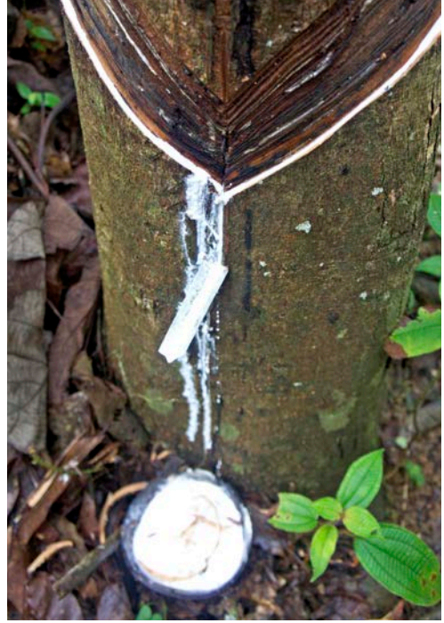
Figure 39. Rubber tree in Sako Tulang, 2014