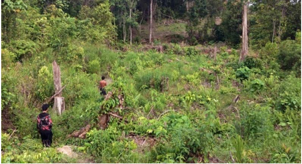
Figure 31. The landscape of the secondary forest in Sako Tulang area