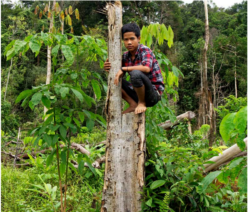
Figure 37. An Orang Rimba bachelor is taking a rest while helping his parents to open the land for a rubber plantation, Sako Tulang, 2013

tasks. For instance, fetching water from the river and collecting fuel wood are tasks that are done mostly by the girls, while the boys mostly learn about hunting and practice skills like tree climbing. The results of hunting small animals are then sometimes consumed as snacks outside meals, and provide a source of animal protein. However, ready-to-eat snacks from the market are also consumed by children from the Sako Tulang group.