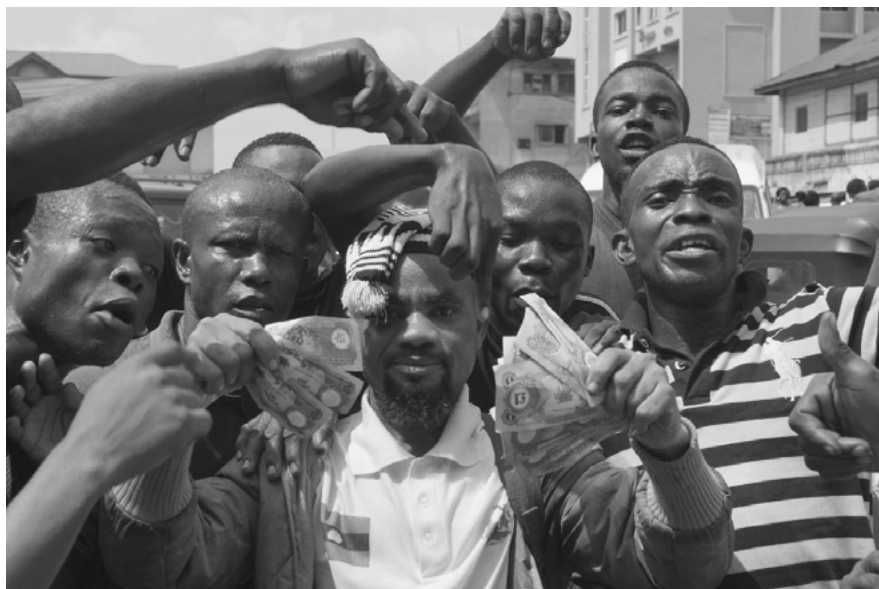
Fig. 3: Protesters in Aba

was shared by many. We are not so interested in the actual figures, but more in the message that is conveyed through such expressions—because an exaggeration of the number of IPOB supporters and protesters reflects the optimism that has been spread successfully by Nnamdi Kanu and his Radio Biafra. The provocative messages of the movements’ leaders that have been directed to the Igbo population in general, and have been taken up strongly by Igbo in the diaspora, have encouraged people to think that the cause is unanimously supported by all Igbo.