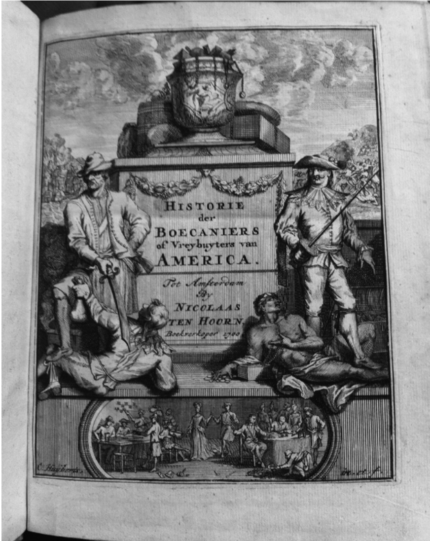
FIGURE 10.9 [Alexander Exquemelin], Historie der Boecaniers, of vrybuyters van America . Amsterdam, 1700, title-page

SPECIAL COLLECTIONS, UNIVERSITY OF AMSTERDAM, OTM O 66-228