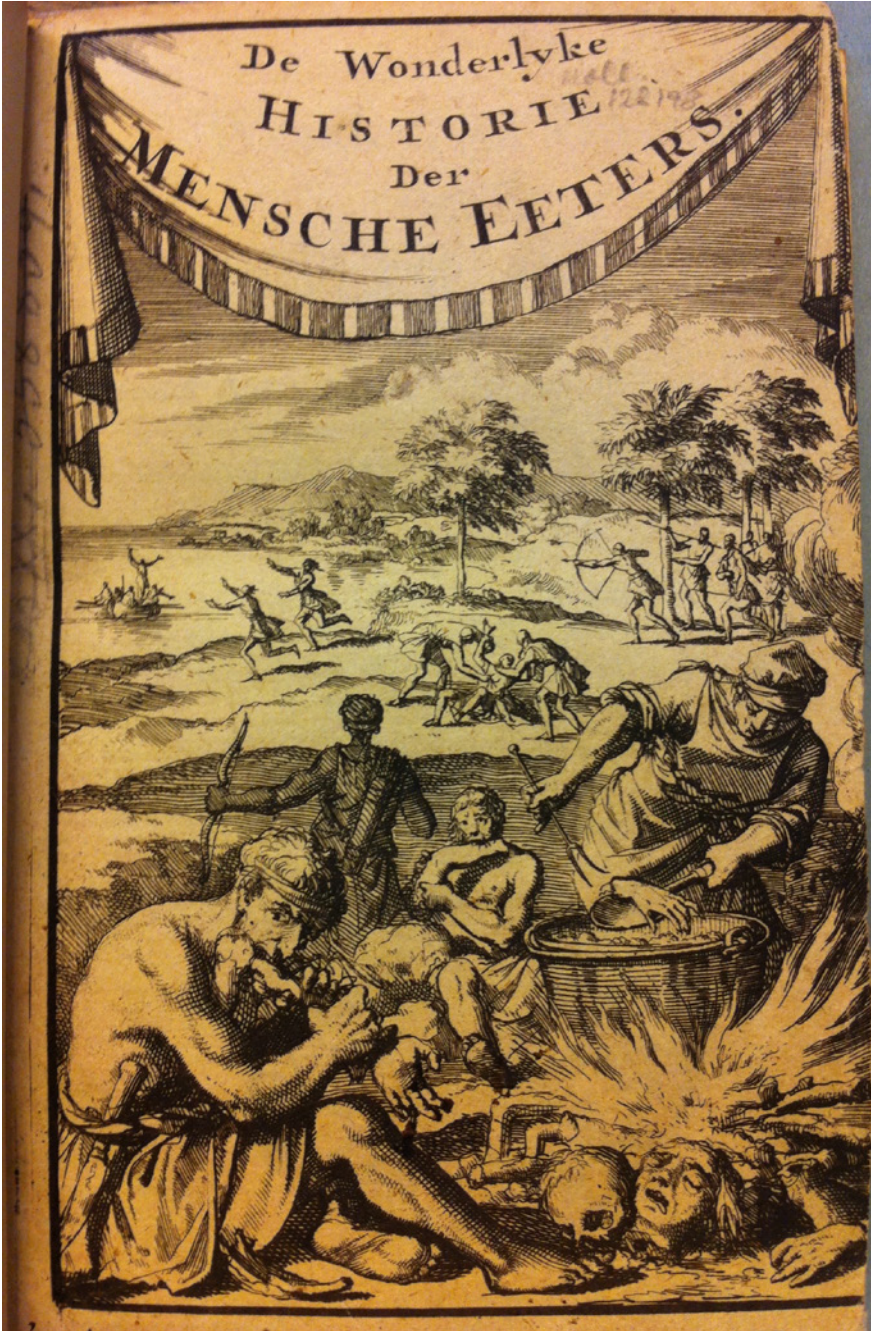
FIGURE 10.8 De wonderlyke historie der Mensche-Eeters. Amsterdam, 1696, title-page SPECIAL COLLECTIONS, UNIVERSITY OF AMSTERDAM, OTM OK 61-580