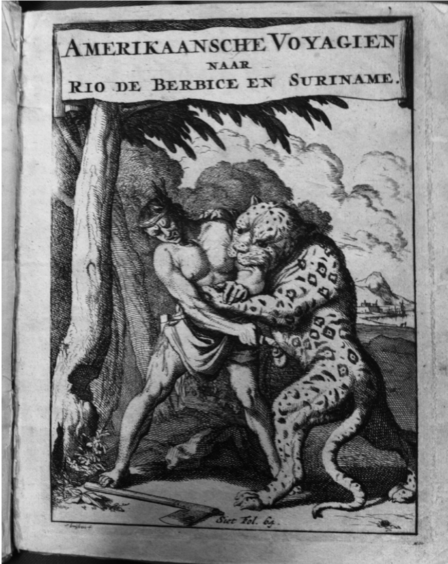
FIGURE 10.7 Adriaen van Berkel, Americaensche voyagien naar Rio de Berbice en Suriname . Amsterdam, 1695, title-page