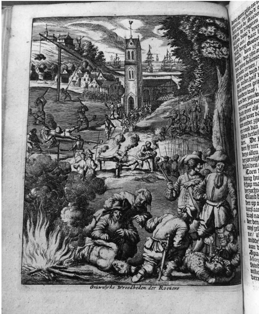
FIGURE 10.3 “Gruesome cruelties performed by the robbers”, in: Edward Melton, Zee- en landreizen door verscheide Gewesten des Werelds , Amsterdam, 1681, pp. 206–7