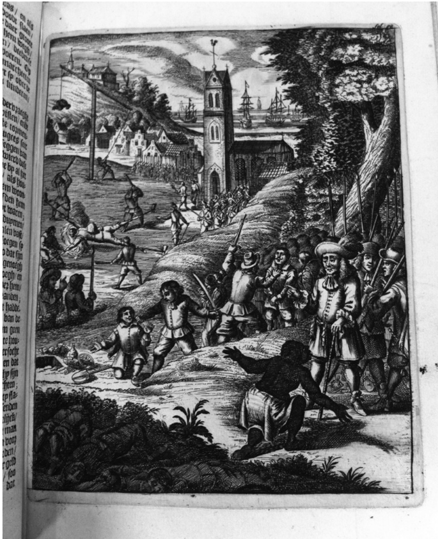
FIGURE 10.2 “An African man points Henry Morgan to the place where he can find his booty”, in: [Alexander Exquemelin], De Americaensche Zee-roovers. Amsterdam, 1678, pp. 98–99