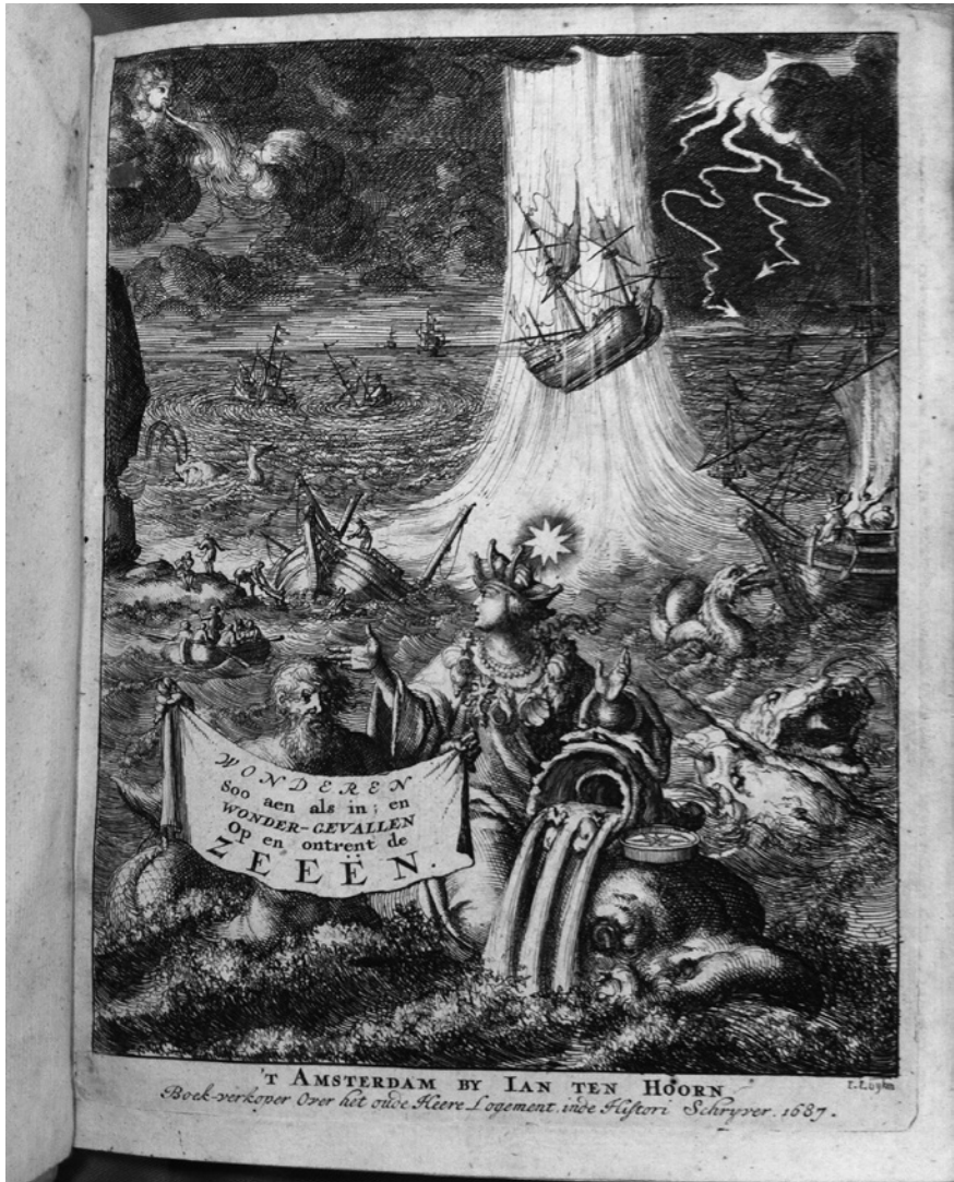
FIGURE 10.6 Simon de Vries, Wonderen soo aen als in; en wonder-gevallen op en omtrent de zeeën . Amsterdam, 1687, title-page SPECIAL COLLECTIONS, UNIVERSITY OF AMSTERDAM, OTM OG 63-4184

between four people including the armchair traveller Polyector and the seaman Marinus which covered everything from Noah's Ark to the abundance of sea turtles in Brazil – embedded tales from the Atlantic world into a broader