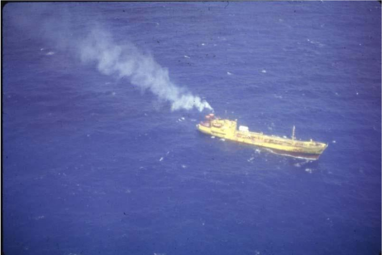
Vulcanus I : The first and oldest incinerator ship of the world, the MT Vulcanus I , was built in 1972 by the Dutch company Ocean Combustion Service. In 1977, the US Air Force employed it to incinerate 2.3 million gallons of Agent Orange at sea.