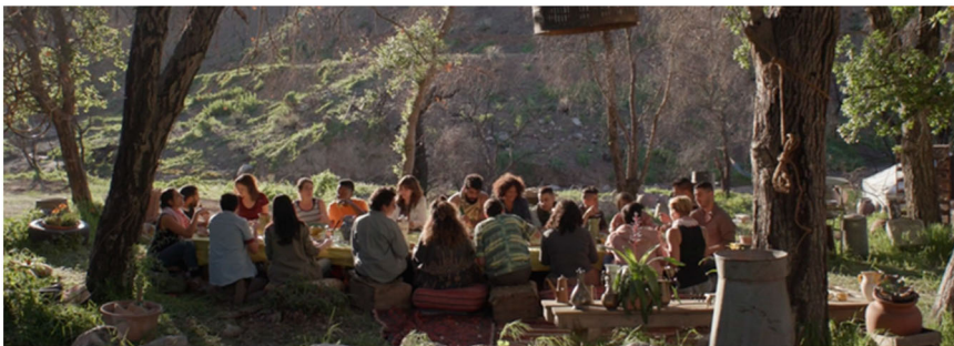
Figure 7. Pinkwashing Machine , 2017. Transparent Season 4, episode 3. Video still.

Despite the secular overtones of Beit Farashe and its milieu, one of the most interesting scenes, is Ali's first visit to the farm. A lunch is held, with much fresh food and Palestinian dishes such as maqloubeh . People are gathered around the long table, which is set outside amongst the idealised, leafy setting of the farm engaged in discussions of liberation, both queer and Palestinian (season 4, episode 6). The image of the long table in this setting subtly conjures the image of both the Last Supper and the Garden of Gethsemane. This reference to the Biblical, and in particular the Christian New Testament, rather than the shared Judeo-Christian Old Testament is interesting on several levels. Firstly, for a series that is predicated on a Jewish American lens, it references highly Christian symbolism. This is arguably demonstrative of a secularist progression of Babington and Evans' de-judaicizing Judaism described above. Secondly, it actively restores the Palestinian body to the landscape through the use of biblified identity markers, that have been stripped of openly religious overtones. Thirdly, the transgressions of the orientalist fedayee /infiltrator body are actively and openly queered in a positive representation – with much appeal to the show's progressive audiences – replacing Orientalist notions of terrorist deviance with liberal displays of sexual diversity.