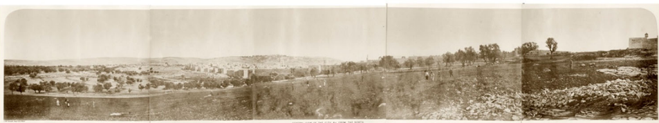
Figure 1. General view of the city from the North. Charles Wilson, Ordnance Survey of Jerusalem 1865.

The class relations that are embedded in the employment of fellahin labourers in images such as Figure 1 underscore a number of important points. Firstly, these images buttress the narrative of an empty, underpopulated and underdeveloped land through the authority of scholarly imaging. This narrative of underdevelopment has significant resonances in western narratives of modernisation of the region (Abusaada 2021: 380). Secondly, and building on the authority of the scholarly, they depict a particular