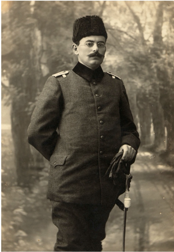
Figure 3. Portrait of Palestinian physician and anthropologist Tawfiq Canaan (1882–1964) between 1905 and 1920. Garabed Krikorian, Königl. Preuss, Hof, Photograph, Jerusalem. Image courtesy of Wikimedia. https://commons.wikimedia.org/wiki/File:Tawfiq_Canaan.jpg .

In the case of Palestinian adoption of the practice, it indicates a transgression of class and urban-rural boundaries in choosing to be photographed wearing ‘traditional’ costume, rather than a cross-cultural transgression. The intent of such Palestinian photographic subjects may be difficult to address from a historical perspective. Was such an action a demonstration of ‘Palestinian-ness’, a performance of nationalism, or was it simply meant as a mode of humour, relying on class transgression? Humour may well have been a significant factor, evident in Figure 4 , which shows both the transgression of class and the transgression of gender. The implications of western visitors participating in the practice may also support a thesis that class rather than cultural transgression was at the core of such middle-class Palestinian performances.