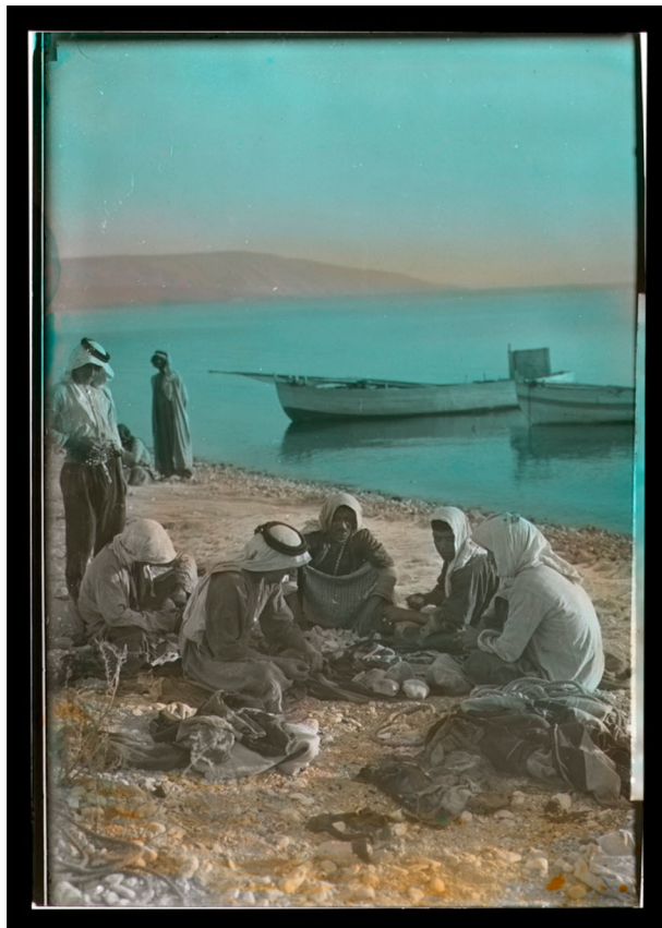
Figure 2. Galilee fishermen Between 1925 and 1946 transparency: safety film, with hand-colouring; 4 × 5 in.