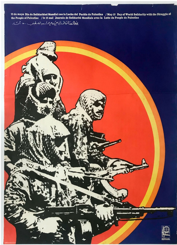
Figure 5. 15th May Day of World Solidarity with the Struggle of the Palestinian People 1980. Designed by Gladys Acosta for OSPAAAL. Collection of the author.

From a political perspective, the porosity of the young Israeli state's borders, and its ethno-nationalist agenda, necessitated a formalisation and policing of which bodies should populate the land and the relationship of the land to both Jewish and Palestinian bodies. In addition to the ethnic cleansing of Palestine during the Nakba , the production