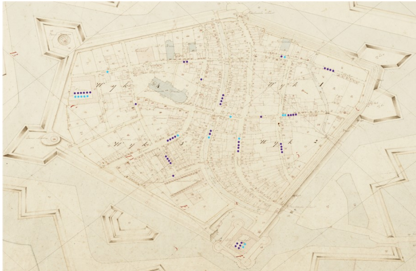
Figure 3 Map of 1866 Woerden with Hotspots of Cholera: Deaths and Recoveries