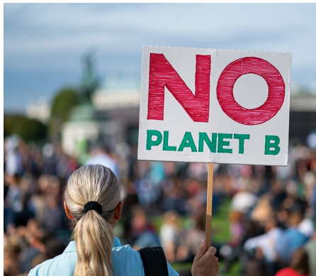
Fig. 4 | There is no planet B. Astronomy is the discipline that understands most keenly that there is no alternative to planet Earth for the survival of our species, and our actions must be consistent with this truth.

change must be coming both in the general population 4 and also among astronomers 26 , but individuals still find it hard to reduce work-related flights due to the perceived damage upon their careers. The number of flights that one takes does not necessarily correlate with academic success, however. While some studies suggest that there is a correlation between the number of flights and the h-index 26 , others find that the underlying correlation is mainly one with salary 27 . In order to be equitable to researchers at all career levels and from all countries, it is critical to collectively agree on a new path at all levels: institutional, national and international. We must embrace virtual tools to enhance scientific collaboration, advocate for a just transition to renewable energy sources, and refuse a return to our