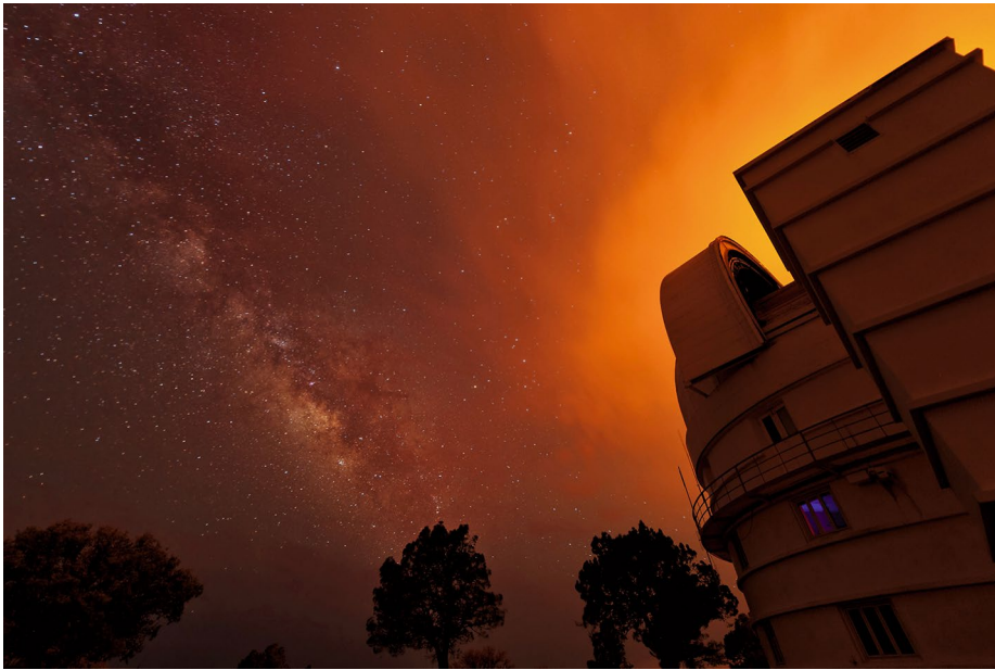
Fig. 2 | A wildfire endangers the McDonald Observatory in Fort Davis, Texas. Astronomers need to reduce their carbon footprint also for their own sake, since ground-based telescopes will become unreliable for research in an extreme climate.

have organized several events, such as sessions and workshops at several major conferences including the annual meetings of the American and European astronomical societies as well as a special symposium in collaboration with the Astronomical Society of the Pacific; a webinar series that educates astronomers about the science of climate change; and numerous public lectures that share the astronomical perspective on our 'pale blue dot'. A4E has also run campaigns to call for climate action within astronomy and beyond, most notably the recent open letter to astronomy institutions that has been signed by about 3,000 astronomy professionals to date.