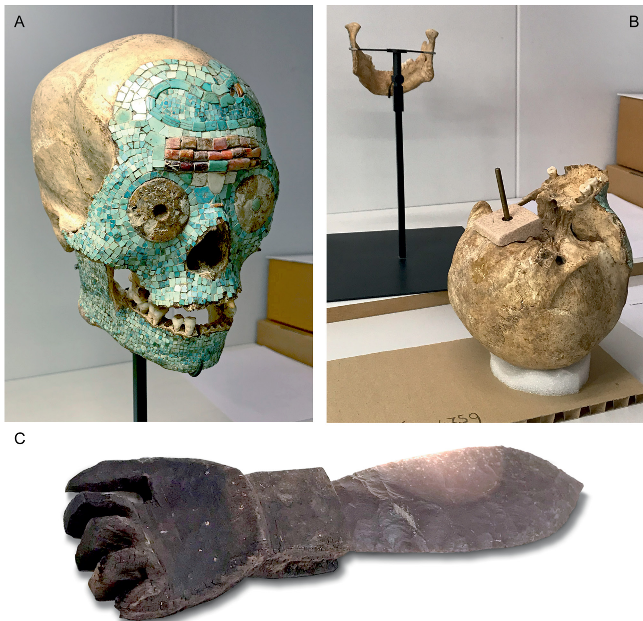
Fig. 1. a. The decorated skull ready to be sampled. b. Before sampling, the stand was removed and thin bone parts were taken from the inside of the skull. c. The ceremonial knife ready to be sampled (Collection Nationaal Museum van Wereldculturen, Coll.Nos RV-4007-1, RV-3928-2. Photo P. Erdil).

display purposes. Dust-like, wooden fibres were clipped out from the wooden handle of the ceremonial knife. The sample preparation protocols used in this study are covered in the following sections and more information can be found in Dee et al. (2020).