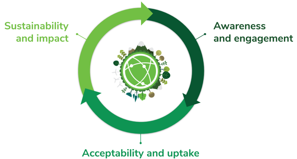
Figure 3. Reinforcing success cycle.

aspects of data acceptability are addressed, it not only improves the value and uptake of the data itself, in many cases it also creates new incentives for engagement and the necessary preconditions for the sustainability and continuation of a CO.