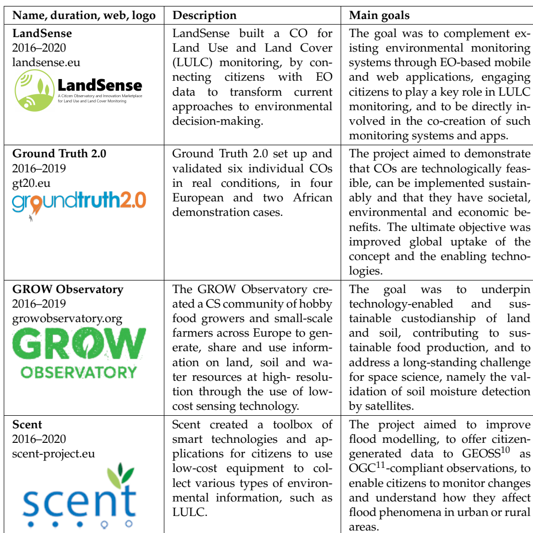
Table 2. Overview of four CO projects funded under Horizon 2020 topic SC5-17-2015.

WeObserve initially identified three key challenges to be systematically addressed in order to facilitate the mainstreaming of COs. They emerged from early discussions sharing the project experiences of the four CO projects and were selected to provide a framework for reflecting on these experiences in greater depth. No comprehensive literature review was done at that time. These three challenges are: