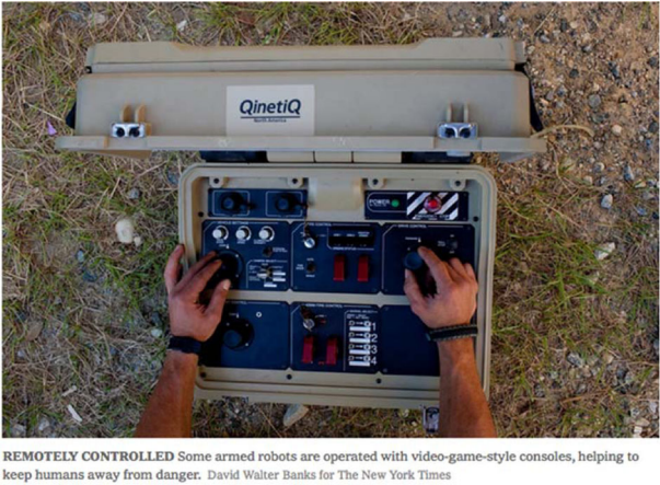
Figure 1. Remote Control, Ft Benning, Georgia, 2010.

Two images frame my contribution to our discussion (figures 1 and 2), both imagining a computationally based situational awareness which simultaneously enables and justifies the exercise of violent action at a distance.