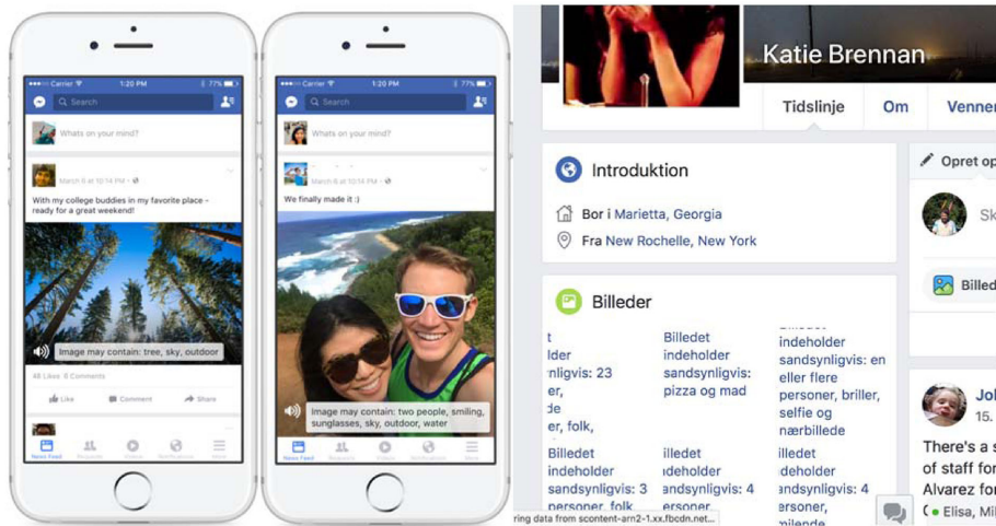
Figure 4. Machine vision-generated descriptions of images. Left: from an illustration in the paper developing the feature (Wu et al. 2017). Right: in use on the Facebook platform of the author, showing image descriptors while loading images. Descriptors help the platform load quickly, and help it track which kinds of image descriptors correlate with user interest. Screenshot taken by Saugmann, October 2018.

that—again like governance through statistics—are similar across dissimilar computer vision systems or different applications of computer vision. The key issue here is what I will call semiotic violence , 8 that is, the violence done unto the visual meaning-making process by computer vision systems.