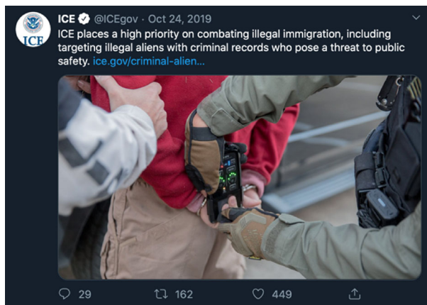
Figure 3. Screenshot taken by Bellanova of a tweet posted by the official account of the US ICE (@ICEgov) on October 24, 2019.