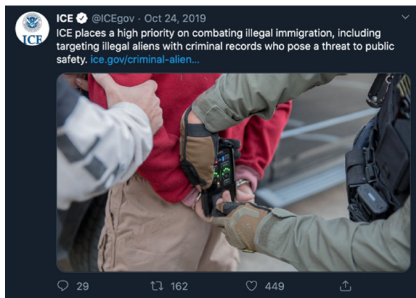
Figure 3. Screenshot taken by Bellanova of a tweet posted by the official account of the US ICE (@ICEgov) on October 24, 2019.