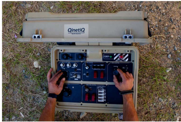
REMOTELY CONTROLLED Some armed robots are operated with video-game-style consoles, helping to keep humans away from danger.

Two images frame my contribution to our discussion (figures 1 and 2), both imagining a computationally based situational awareness which simultaneously enables and justifies the exercise of violent action at a distance.