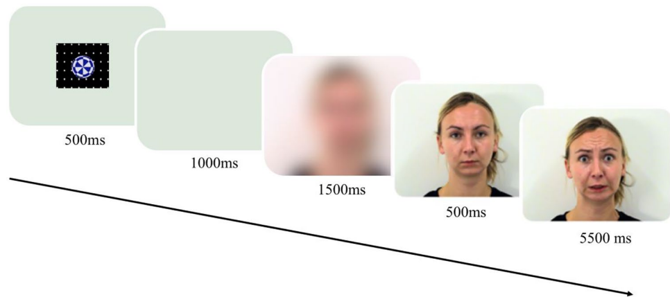
Fig. 2 The time flow of a trial