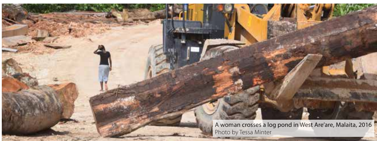
A woman crosses a log pond in West Are'are, Malaita, 2016