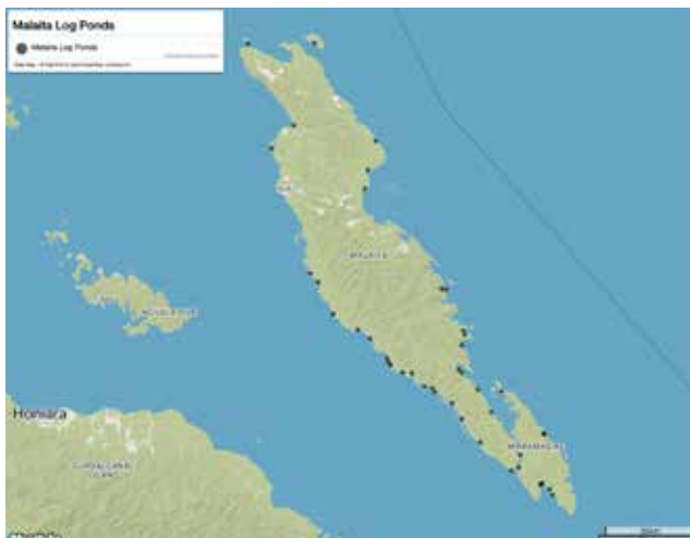
Figure 1. Distribution of log ponds on Malaita, 2019.

While this alarming situation affects both women and men, women and girls experience specific and far-reaching negative impacts owing to their marginalization in ownership and decision making regarding land and natural