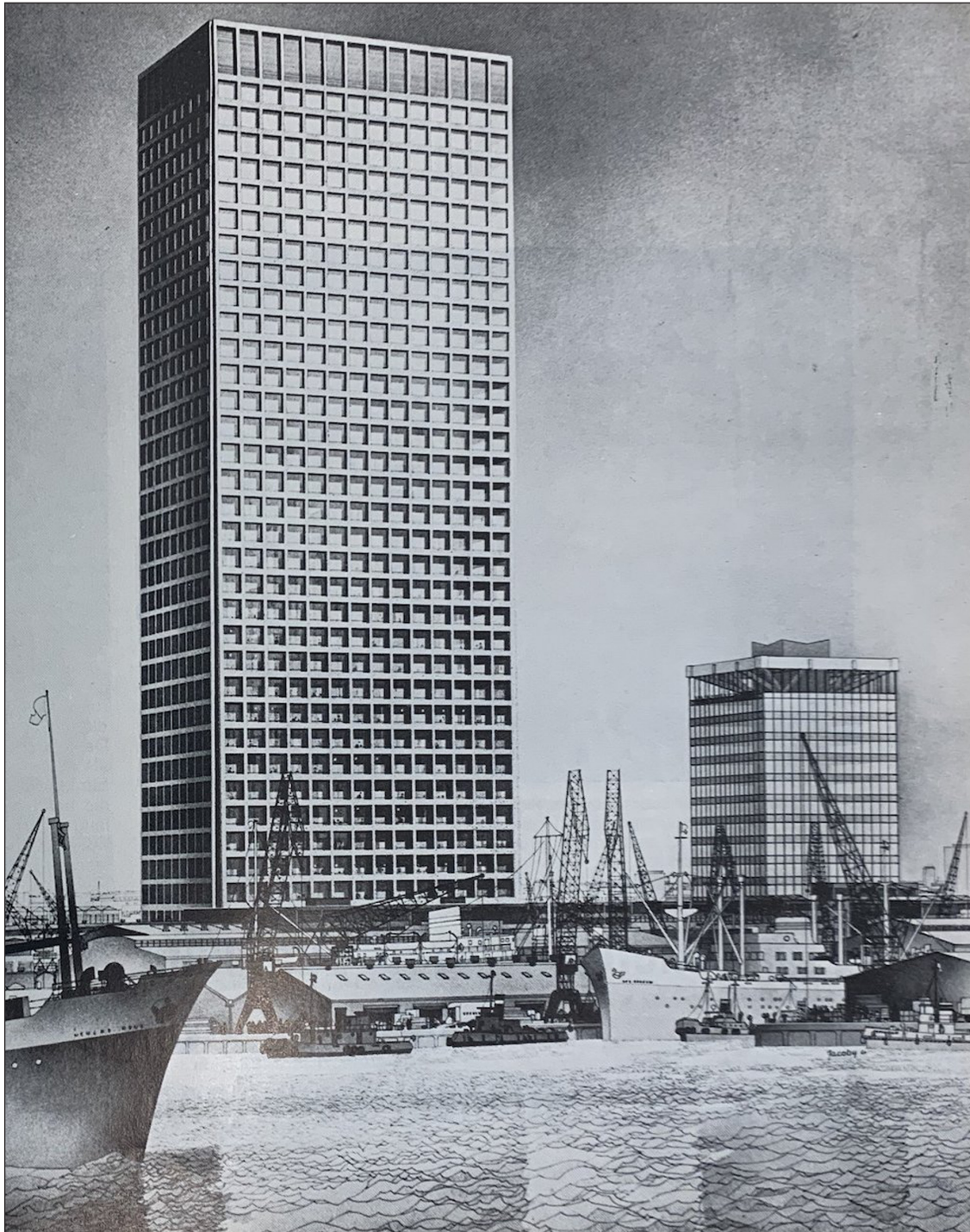
Figure 4: Drawing of the first Europoint tower sitting next to the Overbeek headquarters near Marconiplein (Engel 1969: 1869).

with the quality of Rotterdam's newly built environment, which they characterised as 'cheerless, impersonal, bare, cold, stiff, corporate and clumsy' (1968: 36). Such criticism was repeated ten years later, when the planning journal Wonen TA/BK invited the renowned architecture critics Stanislaus van Moos, Francesco Dal Co, and Kenneth Frampton to evaluate Rotterdam's reconstruction efforts. They were united in their criticism of the city centre—which in the words of Frampton was a collection of 'buildings looking for a city'—although more ambivalent about the Europoint development. Dal Co observed,