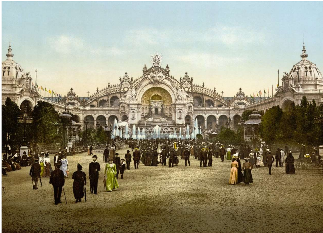
Fig. 3: Eugène Hénard, Palais d'Electricité (with the impressive Château d'Eau by Edmond Paulin), Universal Exposition, Paris 1900 (Source: Wikimedia Commons).

Many of the exhibition pavilions were ephemeral constructions, which had to be economical. Even more permanent buildings, such as the Palais de l'Exposition of 1867 or the Galerie des Machines of 1889, both in Paris, were barely decorated glass and steel buildings. Many buildings at world fairs, thus, were functional constructions designed by engineers. Especially after the First World War, plain industrial buildings became common for most of the general exhibition halls.