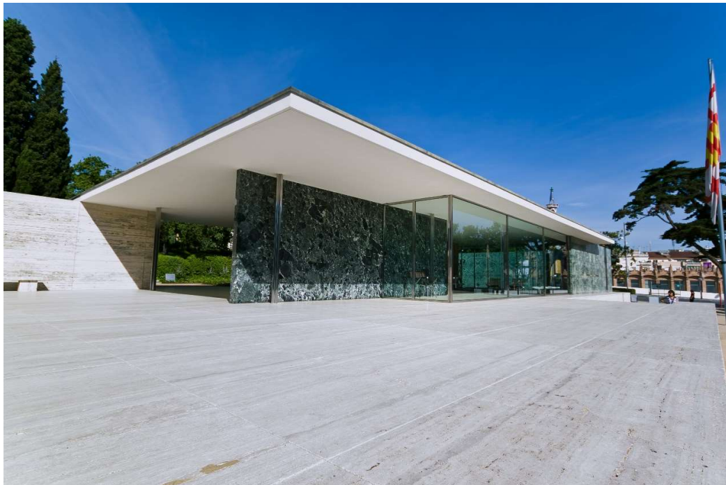
Fig. 2: Mies van der Rohe, German pavilion (this is the reconstructed version dating from 1986), International Exhibition, Barcelona 1929 (Source: Wikimedia Commons).

The International Exhibition of Modern Decorative and Industrial Arts in Paris in 1925 constituted the main exception. Imitations of historical styles were explicitly prohibited by the organizers and as a result most exhibition halls and commercial pavilions were in the new Art Deco style, which derived its name from the exhibition. Of the foreign pavilions, especially those of Belgium, designed by Victor Horta (see illustration 1), Poland by Józef Czajkowski and Great-Britain by Howard Robertson and John Murray Easton showed many of the Art Deco characteristics. 26 In the following years, buildings in this style could also be found at other expositions. For instance, many of the provincial pavilions of both Korea and Japan at the relatively modest Chosun Exhibition, held in Korea in 1929, were built in an Art Deco style. 27 Nonetheless, pavilions in an international avant-garde style remained rare. Probably the main reason was that the planning of a national pavilion generally took several years, while the state authorities who took the main decisions usually had conservative tastes. In addition, these styles seemed to be transient fashions and therefore were not very suitable to represent the nation's permanence. Only in exceptional cases, such as the Parisian exhibition of 1925, many countries dared to abandon well-established patterns.