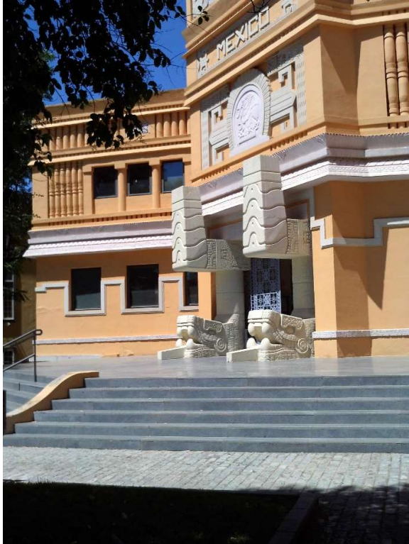
Fig. 5. Manuel Amábilis Domínguez, Main entrance of the Mexican pavilion, Ibero-American Exhibition, Seville, 1929 (Source: Wikimedia Commons).

Manuel Amábilis Domínguez, the architect of the Mexican pavilion in Seville, argued that he wanted to revitalize the art of “our most distant grandfathers” by inspiring himself in the palace and temple ruins of the classical indigenous civilization of the Toltec Empire that had recently been discovered in Uxmal and Chichen Itzá in his native province of Yucatán. He explicitly aimed to update “our national archaic art” by using reinforced concrete – since most buildings in Seville were meant to be permanent, this was also used in many other pavilions – and by adapting them to modern needs and standards. So in this case both the octagonal structure and the lavish decoration of the Mexican pavilion (see illustration 5) were inspired by pre-Columbian archaeological remains. 48 Another quite curious example was the pavilion of Chile. The impressive building was inspired by Spanish colonial architecture, although it also featured some Art Deco touches and pre-Hispanic decorative details. However, its shape and colour represented the snowy peaks of the nation’s gigantic Andes Mountains. 49 As a result, even the natural patrimony of a nation could be combined with its architectural heritage.