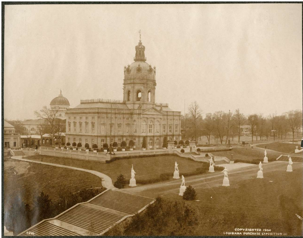
Fig. 4: German Pavilion, Louisiana Purchase Exposition, St. Louis 1903 (Source: Wikimedia Commons).

the basis of prints by the French architect Alfred Chapon, was such a success that it was rebuilt at the Parc Montsouris in Paris, where it survived until 1991. 36 The Ottoman Empire followed suit by building an exact copy of the Sultan Ahmed Fountain, a richly decorated square building with five small domes, at the Vienna World Fair of 1873. The same building also inspired the Ottoman pavilion at the World's Columbian Exposition of 1893, which was designed by the Chicago architect J.A. Thain, although this time it was slightly bigger and not a slavish copy. 37 A somewhat free interpretation of a royal castle was the Hungarian pavilion at the Parisian Universal Exhibition of 1900, which took its inspiration in the Vajdahunyad Castle in Transylvania, where Hungary's most famous king Matthias Corvinus was born. Already at the 1896 Millennial Exhibition in Budapest, where 1,000 years of Hungarian statehood were commemorated, an imitation of this late medieval castle had been a huge success; 38 it even was rebuilt in stone and brick and today houses the Museum of Hungarian Agriculture.