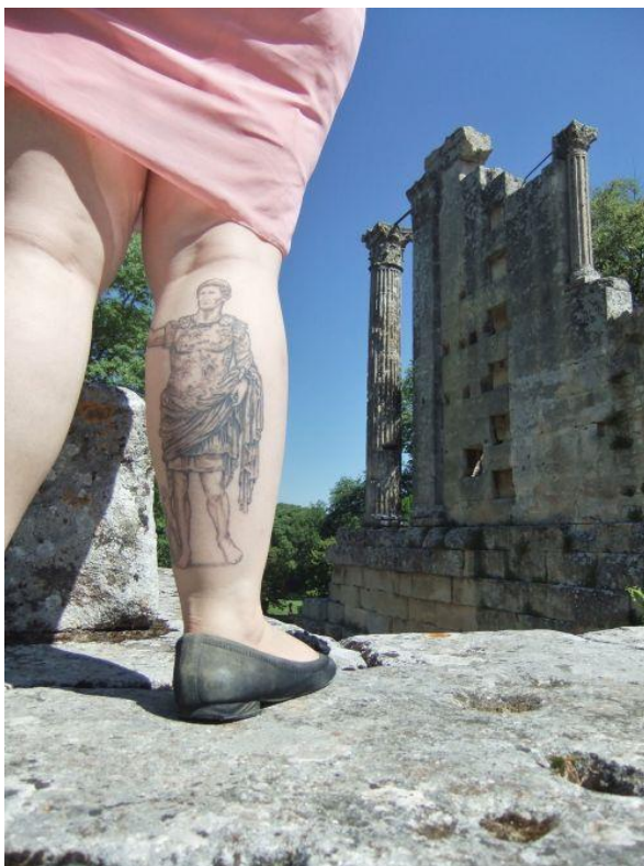
Figure 1: The NEARCH survey (e.g. Martelli-Banégas et al. 2015 ) demonstrated that many European citizens link archaeology to a remote past and do not feel a strong 'personal attachment' to it. However, when they can participate in activities like an art competition, they do so massively and subsequently report positive personal (wellbeing) benefits. The photo of the tattoo was submitted to the art&archaeology contest. Wearing such a tattoo suggests this lady does have a personal attachment to archaeology.

To what extent the public experiences (or expects) an increased knowledge about archaeology as also having a direct impact on their life or wellbeing, is not clear. To my knowledge, this has not been evaluated by means of a representative, transnational quantitative study. There are, on the other hand, some indirect indications that suggest the public may not rate such benefits or impacts very highly for them personally. For example, the respondents to the NEARCH survey did not demonstrate a strong personal connection with archaeology. While 91% say archaeology is of great value and an advantage for a town (86%), and 85% would want to visit an archaeological site and 70% had done so, a much smaller number (54%) said archaeology is a field for which they feel a personal attachment (Figure 1). Among younger people (18-24 years of age) this attachment is even less (40%).