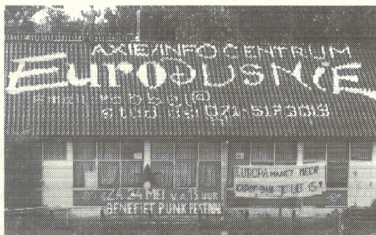
Ons gebouw aan de Boerhaavelaan

wereldwijde strijd tegen monarchieën. En in het weekend van 31 maart, 1 en 2 april, vieren we groot feest, want dan bestaat EuroDusnie 3 jaar en iedereen is natuurlijk uitgenodigd om dit met ons mee te vieren. Het wordt een spetterend feest en er komen interessante discussies. Meer hierover kun je elders in Dusnieuws lezen. Het allerlaatste nieuws is dat Zwarte Sterren op vrijdag 28 april, de dag voor koninginnedag, een benefietconcert organiseert voor COMODO. Wie precies komen is nog niet geheel duidelijk maar in ieder geval speelt de Antifare uit Antwerpen. Een laatste bericht voor de internetters onder ons: ons nieuwe adres: http://squat.net/eurodusnie