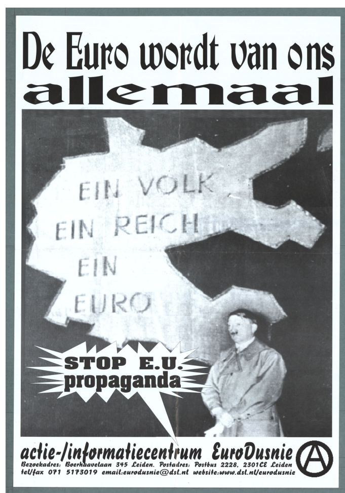
Figure 2. Poster Eurodusnie, “De Euro wordt van ons allemaal” (2001). Eurodusnie activists soon discovered that spectacular actions or images could garner media attention. The printing and distribution of a poster that showed Hitler in front of the slogan ‘Ein Volk, Ein Reich, Ein Euro’ was one example of the collective’s provocative media strategy.

information. In a similar way, semi-structured interviews with two former Eurodusnie activists and two Leiden journalists helped to contextualise information and gain insight into the ways local activists and local journalists interacted. During these interviews, we asked Eurodusnie activists how they interpreted local news reporting and what strategies they devised for dealing with local journalists, while we asked local journalists how they interacted with Eurodusnie activists and responded to their strategies. As with national newspaper reports, this source type has not been analysed systematically, since the focus of our research is the framing and counter-framing of local activists and local news media through their mediums (i.e., Leidsch Dagblad and Dusnieuws ).