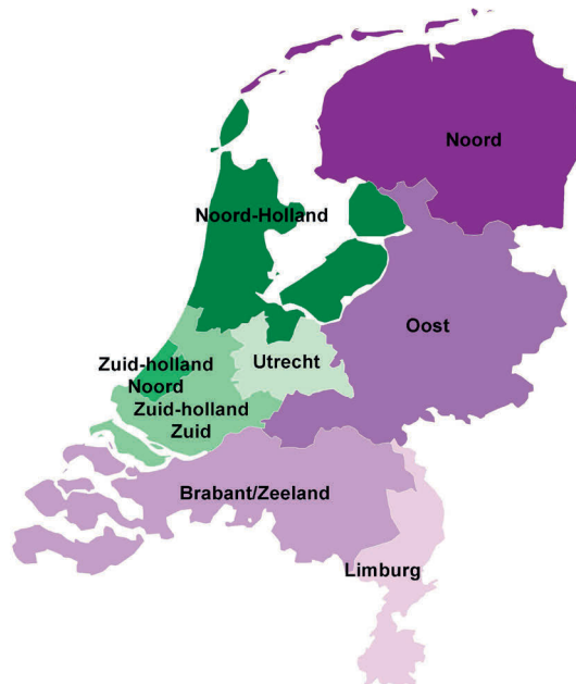
Figure 2.1. Regions for sexual health care in the Netherlands. Purple areas indicate the more rural regions, green areas indicate the more urban regions.

To study regional differences in epidemiology of acute hepatitis B, we stratified statistical analyses by region (Figure 2.1). Furthermore, all cases were mapped using the geographic information system ArcGIS software, version 10.1. The postal code was used to identify the geographic location of cases, but data were aggregated and analysed on municipality level for privacy reasons. Incidences per municipality were calculated per 100,000 population. To identify geographic clusters of cases in the period 2009-2013, cluster analysis on municipality level was performed using the SaTScan software version 9.0 [9]. We used a discrete Poisson model, which assumes that the number of cases in each location is Poisson-distributed, and analysed the data with the space-time scan statistic to identify clusters in space and time. The space-time scan statistic uses cylindrical search windows in a space-time cube in order to seek significant spatio-temporal clusters. We set SaTScan to scan only for areas with high rates, that is for clusters.