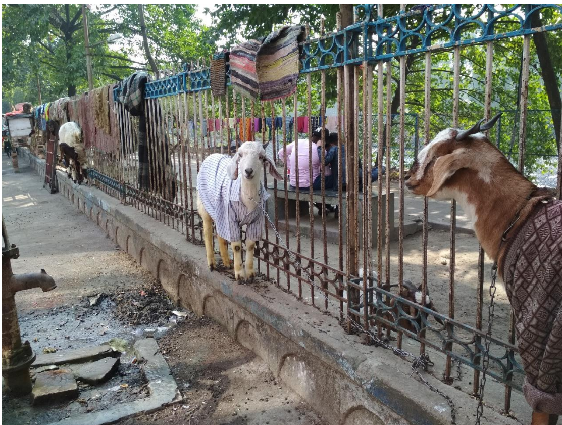
Figure 3.5. A CMC park by the Pali Nala put to various use by the dwellers nearby.