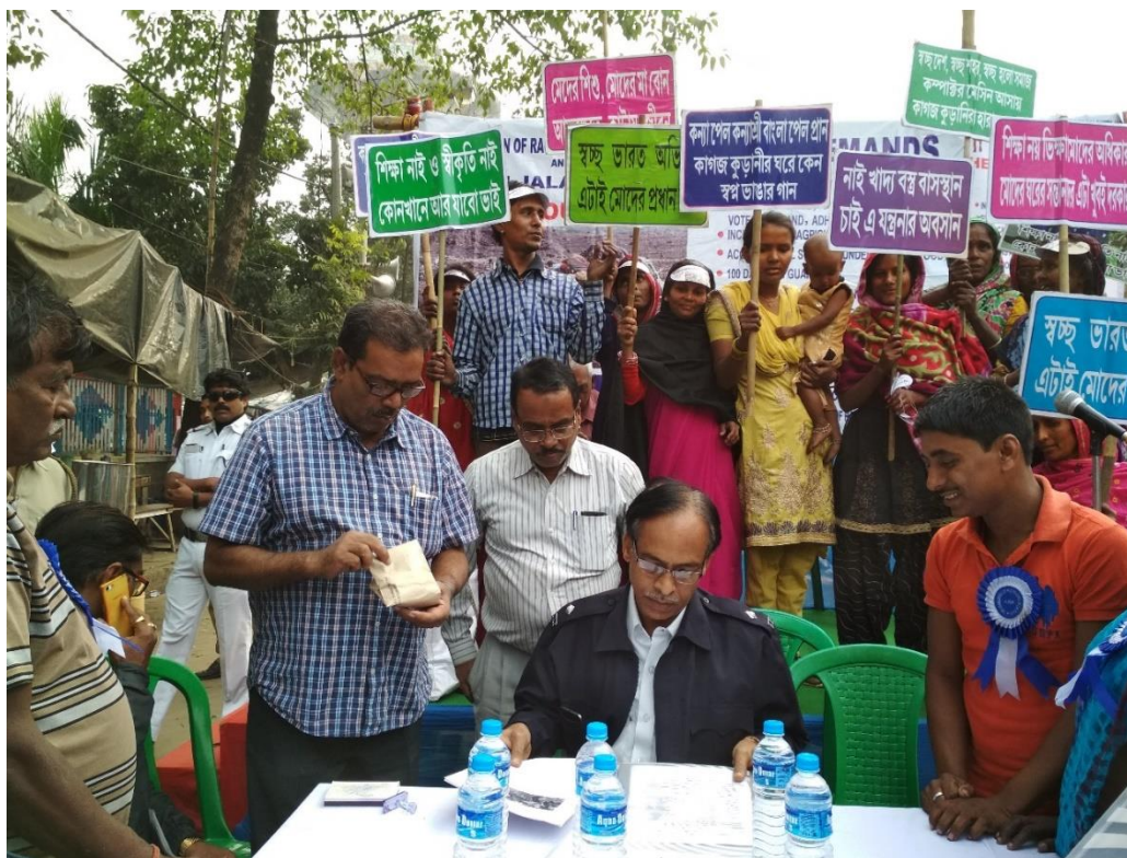
Figure 3.20. The rag pickers handing their memorandum to the police sergeant at the Dharmatala area on behalf of the Association of Rag Pickers (ARP) with their demands