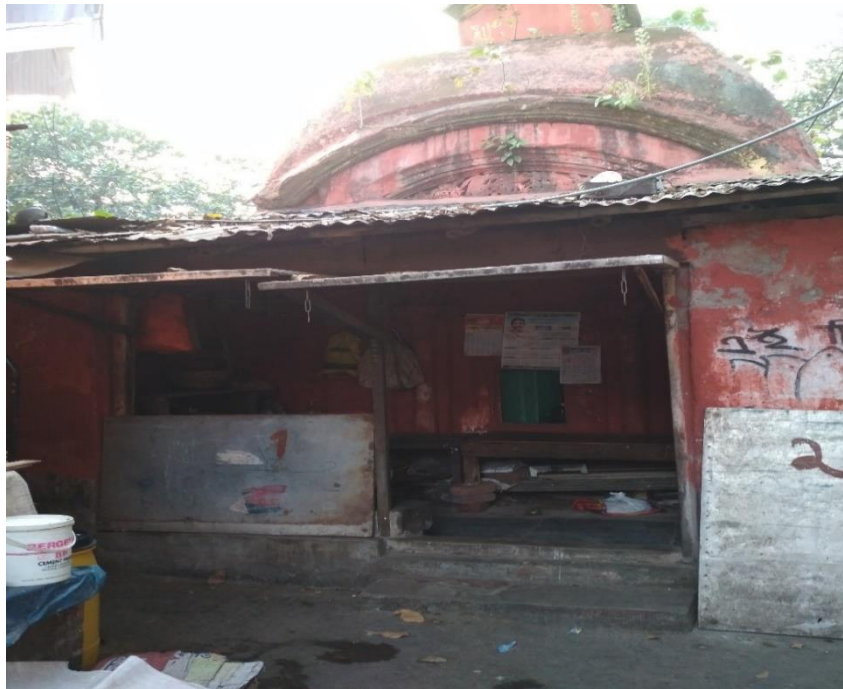
Figure 3.7. A temple by the Pali Nala which now functions as a tea stall.