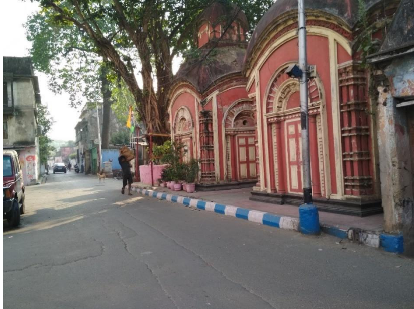
Figure 3.6. An old temple by the Pali Nala.

Othano Jayni Dakhaldarder, Kendrer 30 Koti Taka Pore," Bartaman, Hawker Sangram Committee Archive, 2000 )