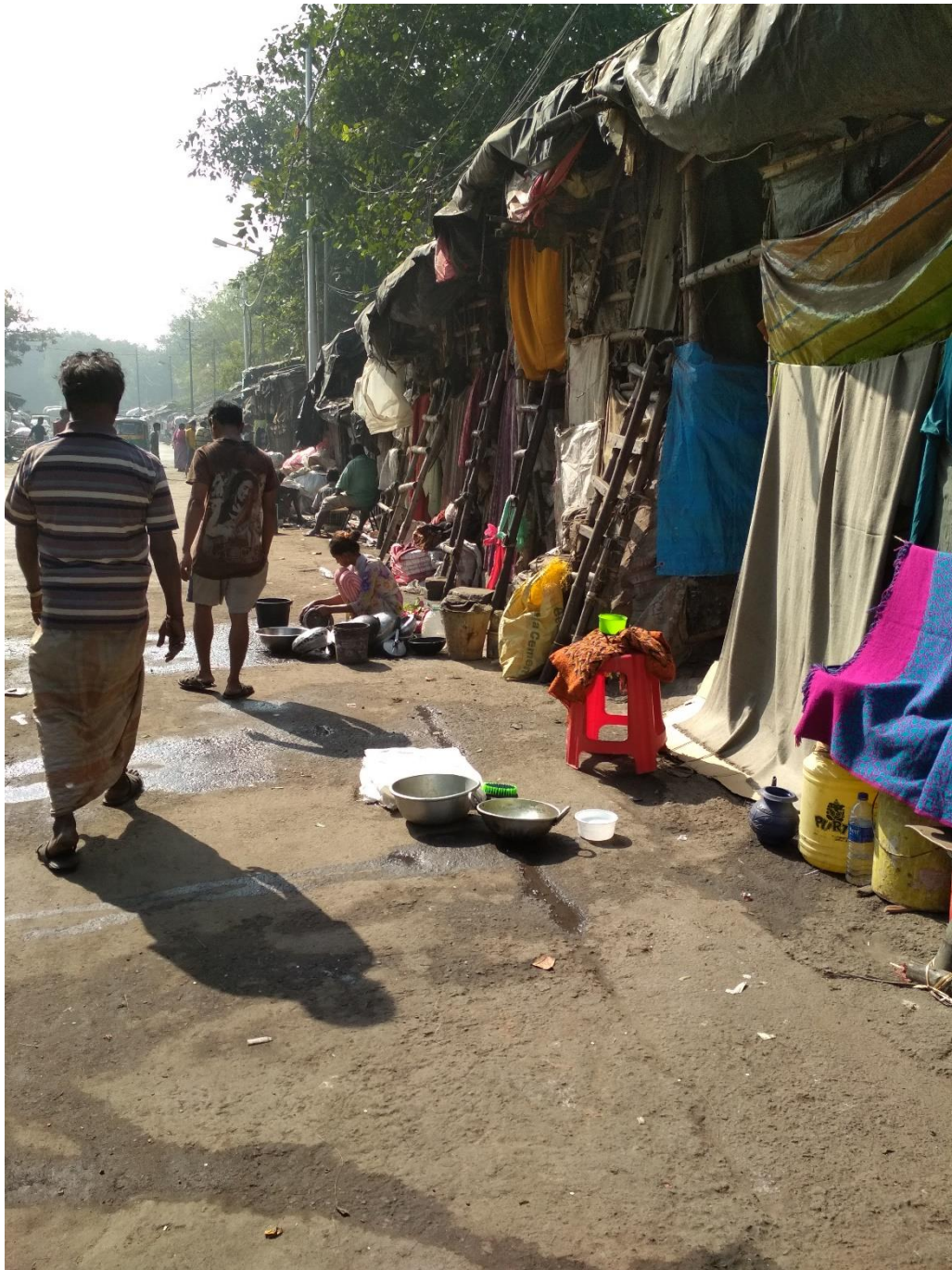
Figure 3.9. Dwellings by the Round Canal. Ladders are placed outside the homes to provide access to the upper storey.

with rope) and chat, young children play, the very young defecate on the streets, people queue up to collect water from what is locally known as time kal (tap). Time kal is a name given to taps installed by the CMC where water comes at specific times of the day. Young and old alike take bath in the water flowing from the time kal , waste pickers sort their days' pick in front of their homes, cattle stand tied to poles and people go about their daily business. Vehicles pass slowly through.