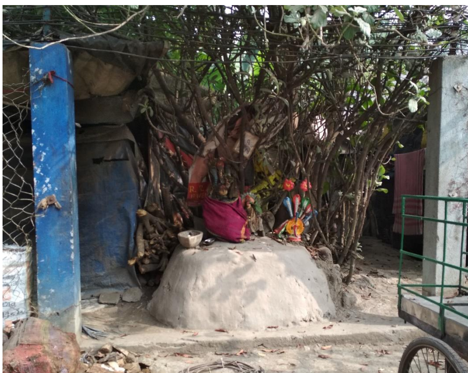
Figure 3.8. A place of worship under a tree with an idol of Manasa, a snake goddess by the Round Canal.

As one moves eastward by the Pali Nala, the dwellings are relatively recent. The eastern parts of the canal present a landscape similar to that of the Round Canal noted above. Shanties intersperse with small workshops, temples, roadside markets and offices of political parties making these places hubs of vibrant activity. Some of the roads in this eastern stretch have been recently laid out. A large part of the eastern stretch of the canal has now been cleared of shanties in course of recent eviction drives and railed as discussed later in the chapter. Evictions took place in the wake of an extension of the city's subway system towards the south and south east along the canal. Newly laid out roads that run parallel to the Pali Nala bear the names of the new subway stations.