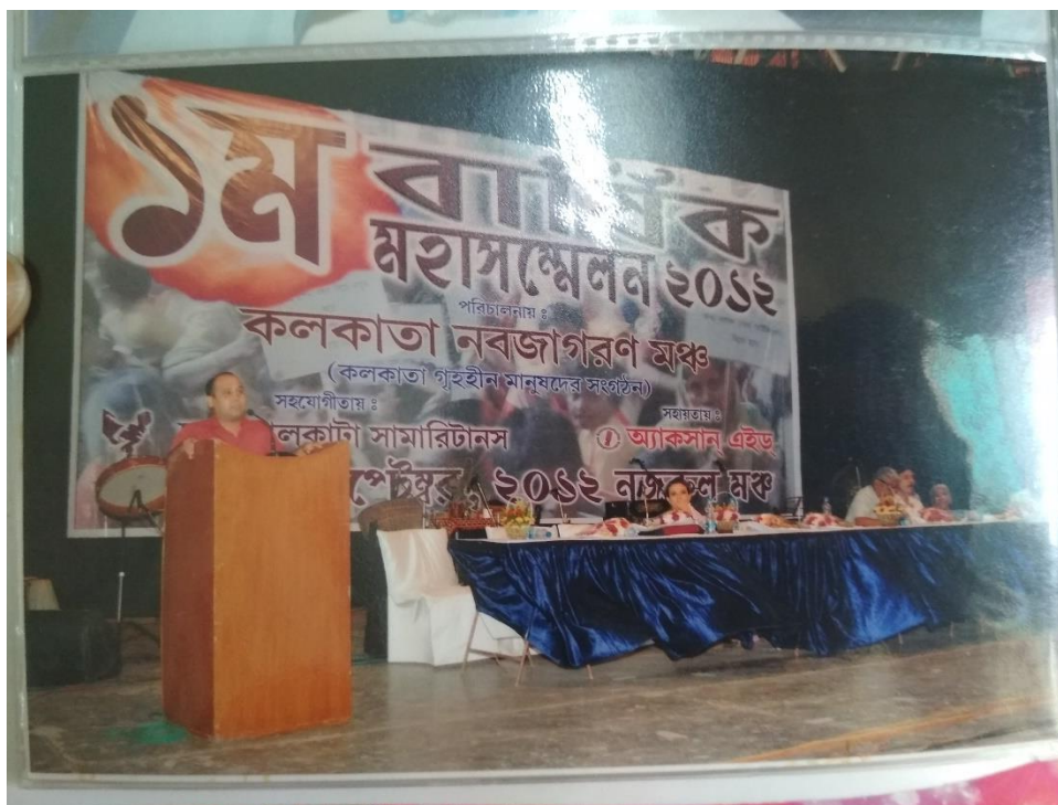
Figure 3.17. An image of the first Annual General Meeting of the Kolkata Nabajagaran Mancha

For some time, they conducted meetings at regular intervals among themselves to discuss issues of common interest. The KNJM also organised yearly general meetings for two consecutive years in 2012 and 2013.