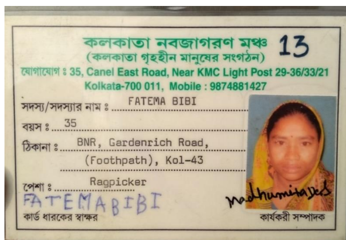
Figure 3.18. An identity card of an erstwhile member of the Calcutta Naba Jagaran Mancha.

educated. Bulk of the members of the KNJM are illiterate. By their own admission, the leaders of the KNJM depended on TCS to carry out official formalities, drafting and documentation. They find it difficult to conduct negotiations with office bearers regarding different problems faced by the community members. The members do not have the confidence to undertake legal action of their own. Procedures relating to filing complaints in the police stations, following up on complaints, methods of initiating Right to Information (RTI) petitions used to extract information from official departments are difficult for them to conduct. They face threats by local goons, political parties and sometimes by the male members of their own families ("Impact Assessment Report on Intervention under Project Titled: An Alliance to Address the Issue of Urban 'homeless' and Unregistered Slums in Kolkata," The Calcutta Samaritan & Action Aid , n.d., 25-45). Many of my interlocutors mentioned that eventually the KNJM has stopped functioning.