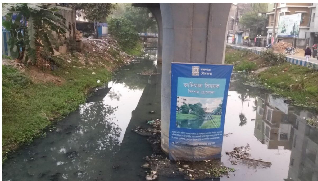
Figure 3.12. A CMC signboard stating that throwing garbage in the Pali Nala is a punishable offence under the Calcutta Municipal Act 1980.

and did not start until the beginning of the new millennium. Together with this, there were schemes of beautification of the canal banks. From 2000, ADB funds were also put into use for sewerage canal renovation. The canals were to be made navigable where boats could ply. Gardens were to be grown along their banks where the middle-classes could take a morning stroll, or enjoy a boat ride in the evening. Later on, added to the beautification drive, an extension of Calcutta's metro railway line in the southern suburbs along the course of the Pali Nala was undertaken. It was declared that the shanties by the banks of the canals should be cleared for the proper implementation of the projects.