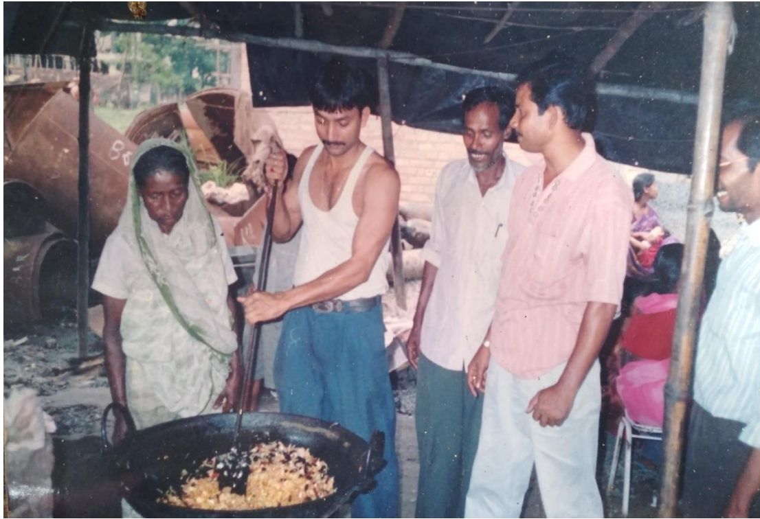
Figure 3.14. A photo of a food kitchen opened at the Pali Nala by volunteer organisations in the immediate aftermath of the evictions in 2001