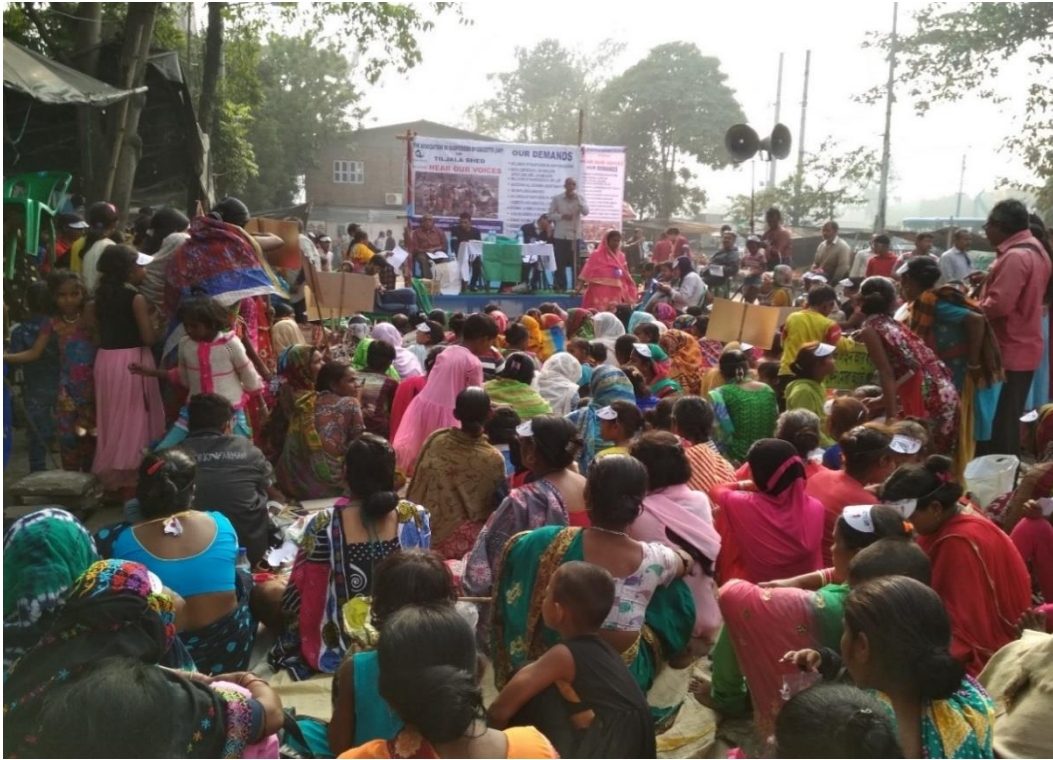
Figure 3.19. The converging point of a rally organised by the Association of Rag Pickers (ARP) on 19 December 2017 at central Calcutta.