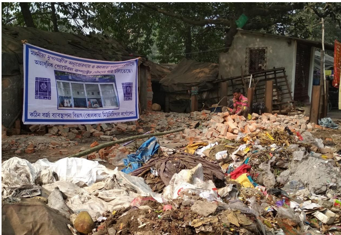
Figure 3.4. A CMC notice in a vat at the Round Canal declaring that the work of creating a solid waste compactor station is underway.

A wide variety of garages, workshops, timber processing units, saw mills, small clubs, places of worship under the shade of sacred trees, local party offices intersperse with dwellings. Wayside tea and snack stalls and a whole range of other small food outlets also line the canal banks. Further north along the Round Canal, in the Ragbazar area, a weekly market is held on Sundays where birds are sold. I have interacted with the families in this stretch of the canal in the Ragbazar area. They are Bengali speaking Hindus mostly coming from south 24 Parganas. From the first decade of the new millennium, parks have started to appear by the canal banks. At the Round Canal, I found most of the parks to be locked and shut to the dwellers. The railings of the parks are put to various uses like drying clothes or tying cattle.