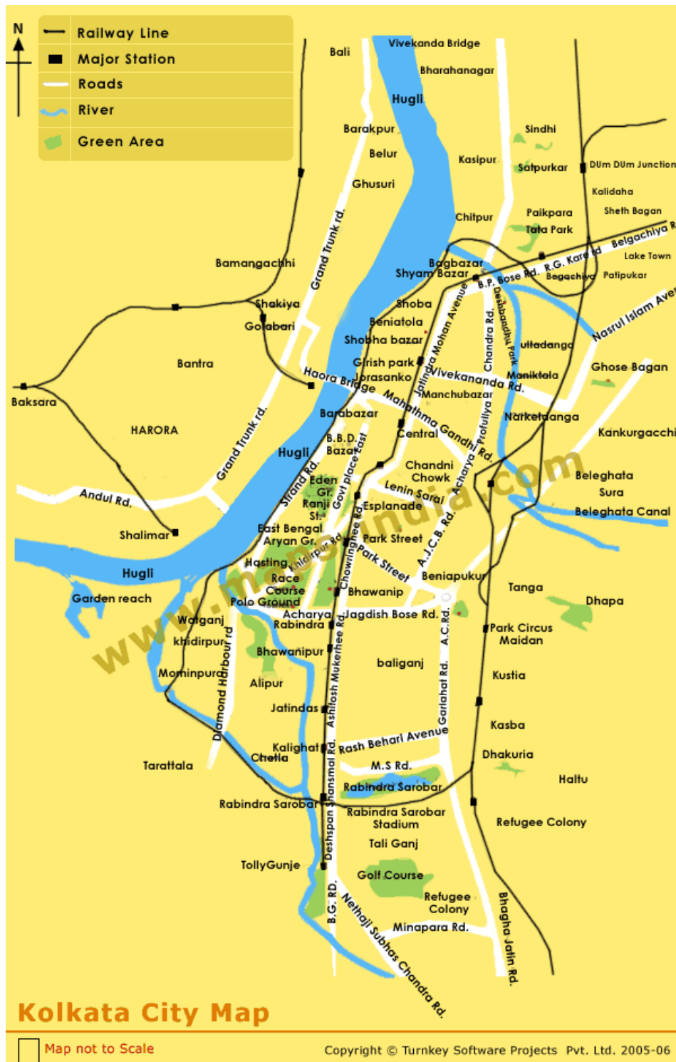
Map 3.2. The sewerage canals of Calcutta

The water that flows through the Round Canal is of a dark hue. It emits a strong stench. The canal side roads are potholed and in tattered condition. They carry a traffic of trucks, mini trucks, occasional private cars, rickshaw vans and other vehicles. As one walks on the C west road from the Ramhata main road towards the river Ganga (which is the western most boundary of Calcutta) and