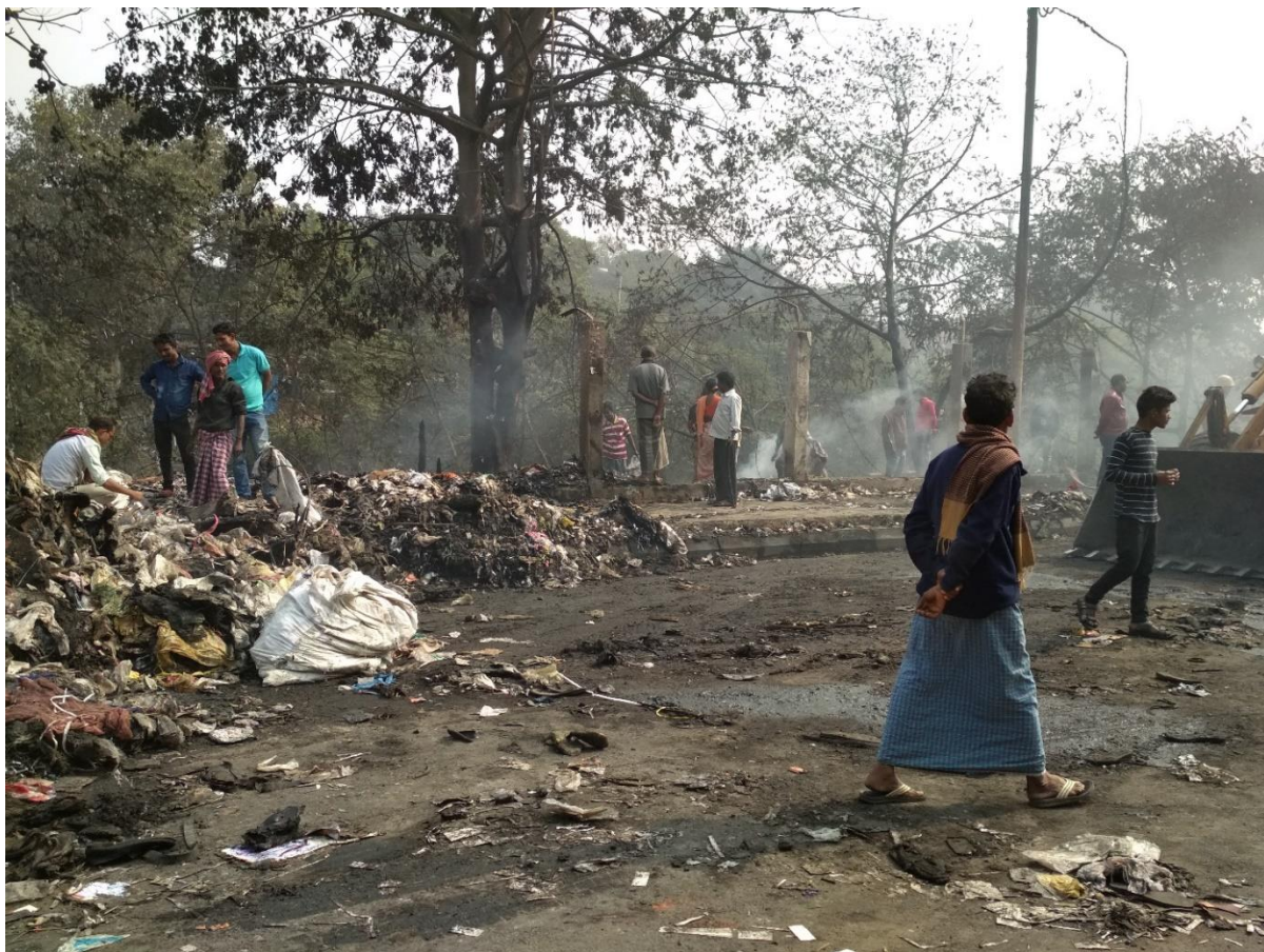
Figure 3.11. In the aftermath of a fire at the Kuldanga area of the Round Canal on 14 January 2018. Eleven dwelling houses were burnt down. Cleaning operation is seen to be under way under the supervision of the ward councillor.

These areas have increasingly seen more everyday forms of displacements. The two pockets of dwellings at the Round Canal and the one at Pali Nala that I visited have known many instances of fires. Stories of fire are alive in the memories of the dwellers and are repeated during long discussions. In their memories, often no clear separations are made between official eviction drives and the numerous everyday forms of displacements that are intermeshed with their lives, meted out by increasing number of fires, by the halla of the corporation, or simply by the local boys of the party in power. Prior notifications are often not needed and evictions do not make any news at all.