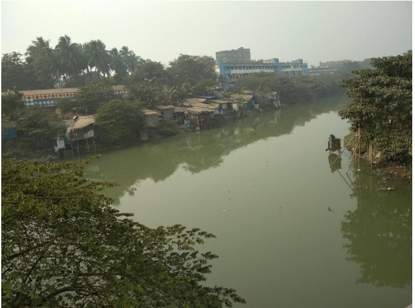
Figure 3.2. A glimpse of the Round Canal from the Ragbazar area where a dense spread of dwellings can be seen on the slope of the canal.

passes the Kuldanga rail bridge (a rail bridge over a railway line of the Calcutta Suburban Railway network passing over the canal) trucks and buses can be seen parked by the sides. Further down, there is a pay and use toilet which has been recently installed, an important marker of the landscape of khalpar . Shanties begin to appear behind piles of rags. Big packed sacks can be seen next to heaps of debris. The sacks contain material that are packed after being sorted, which will be sold at nearby shops within the next few days for recycling.