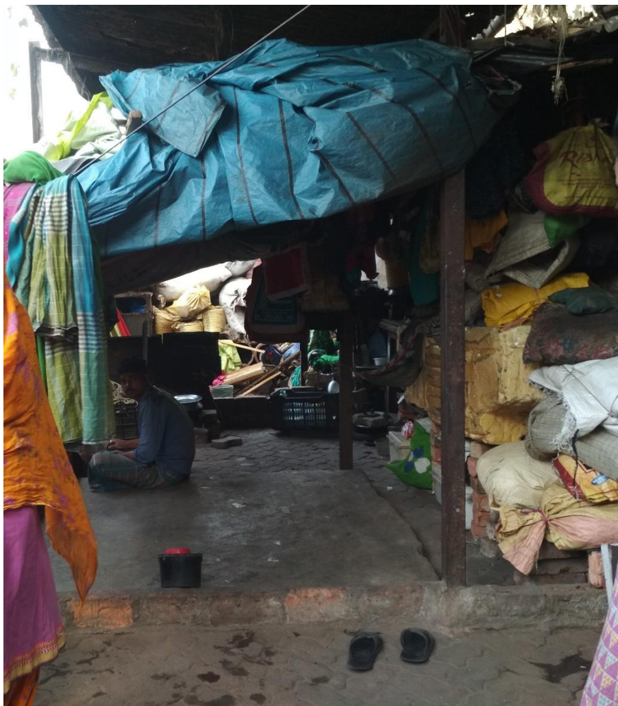
Figure 3.10. A pavement dwelling on the KC Road.

A group of about 40-50 families live at this foot on the Krafulla Chandra road (KC) next to a vat. The vat is the source of livelihood for these waste picker families. The KC road is one of the main north south arteries of the city. The dwellings are also close to an important government school. According to the dwellers, they have been living here for more than three decades. They negotiate eviction threats on an everyday basis. They hear rumours of a future plan of creating a small park at the area by cleaning the pavement.