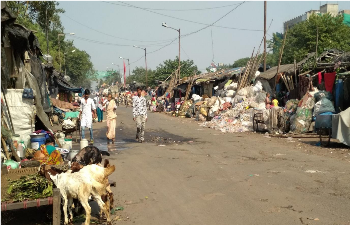
Figure 3.3. Piles of rags can be seen outside the dwellings at the Round Canal.

A little way ahead there is an office of the Greater Calcutta Gas Supply Corporation. There is a mosque close by. The inhabitants of this area, the Kuldanga-Raibazar stretch of the canal, are primarily Muslims. Some of them are Hindi speaking and have come from villages in Bihar. Garbage dumps of different sizes can be seen in the street corners. In some of the garbage vats, a machine called the solid waste compactor has been installed by the CMC in recent years. It is a machine for collecting solid waste from the vats. It threatens to render the local waste pickers who work at these vats jobless.