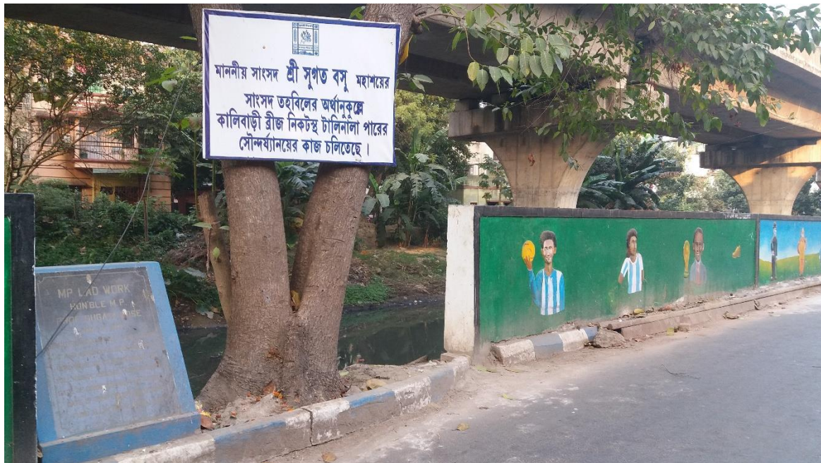
Figure 3.15. Walls have been built by the south-eastern stretch of the Pali Nala after evictions.