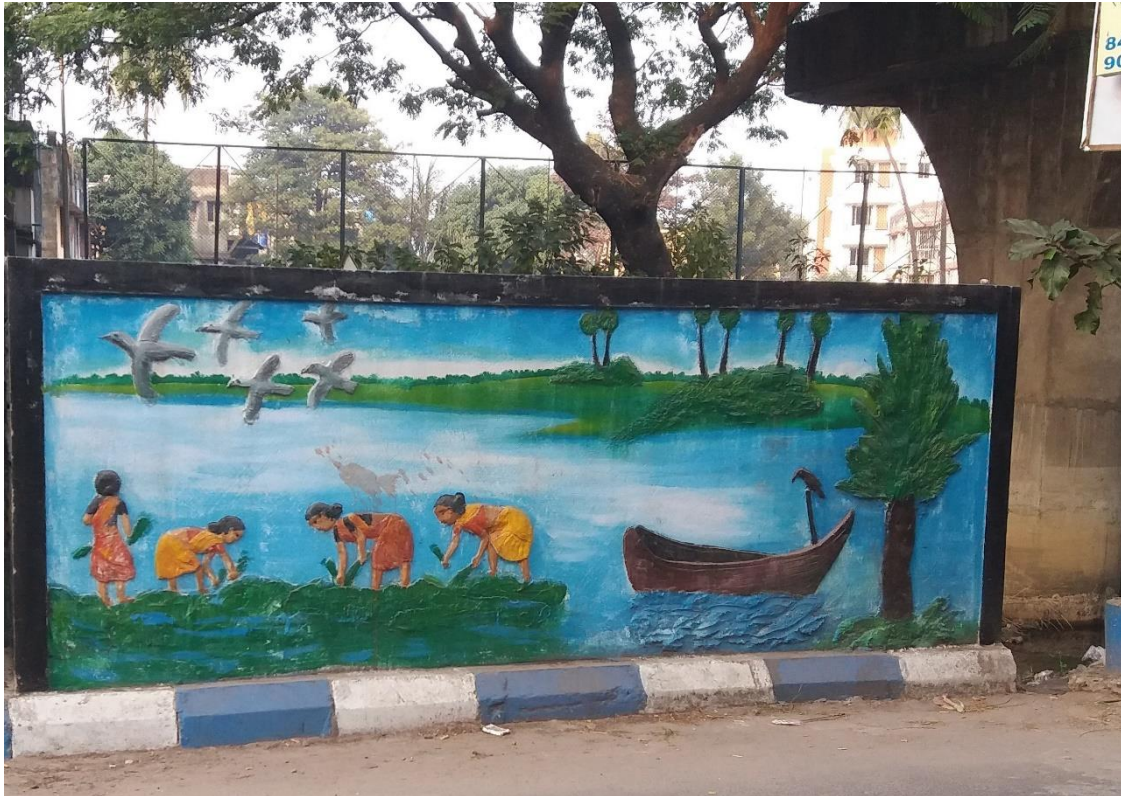
Figure 3.16. A wall painting by the Pali Nala depicting an idyllic image of the canal side where boats ply and women reap paddy from fields on the banks of the canal.

It was officially declared that the 'encroachers' had no right to rehabilitation. But at the same time, the government also made vague promises of some form of rehabilitation for the evicted shanty dwellers in government housing schemes for lower income groups, like the Balmiki Ambedkar Abash Yojana. 15 But as the subsequent years proved, no rehabilitation was provided.