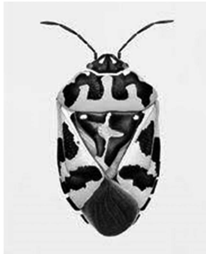
Figure 1. Garden bugs, Kussaberg (Germany), close to Leibstadt nuclear power plant, by C. Hesse-Honegger (Raffles, 2010).

facilitate a more exploratory approach to rendering data interpretable and analyzable (for a discussion, see Waltman & Van Eck, 2016) 4 .