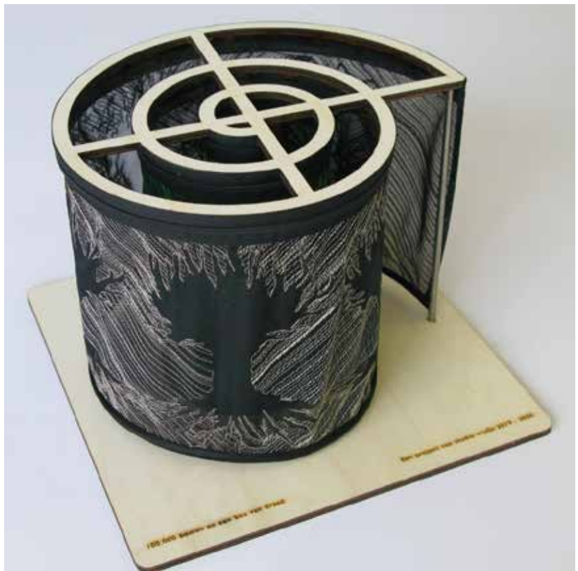
Fig. 8: Sara Vrugt, 100.000 trees and a forest of thread, 2020, model for installation with embroidery

This project was carried out in 2020 and in terms of content concerns the relationship between humans and nature, climate change and in particular deforestation. For this project too, Vrugt worked together with participants to make the embroidery. However, in this project the participants were not necessarily bound to a specific geographical location. The workshop in which the embroidery was made was also not located in one specific place as with Look at you