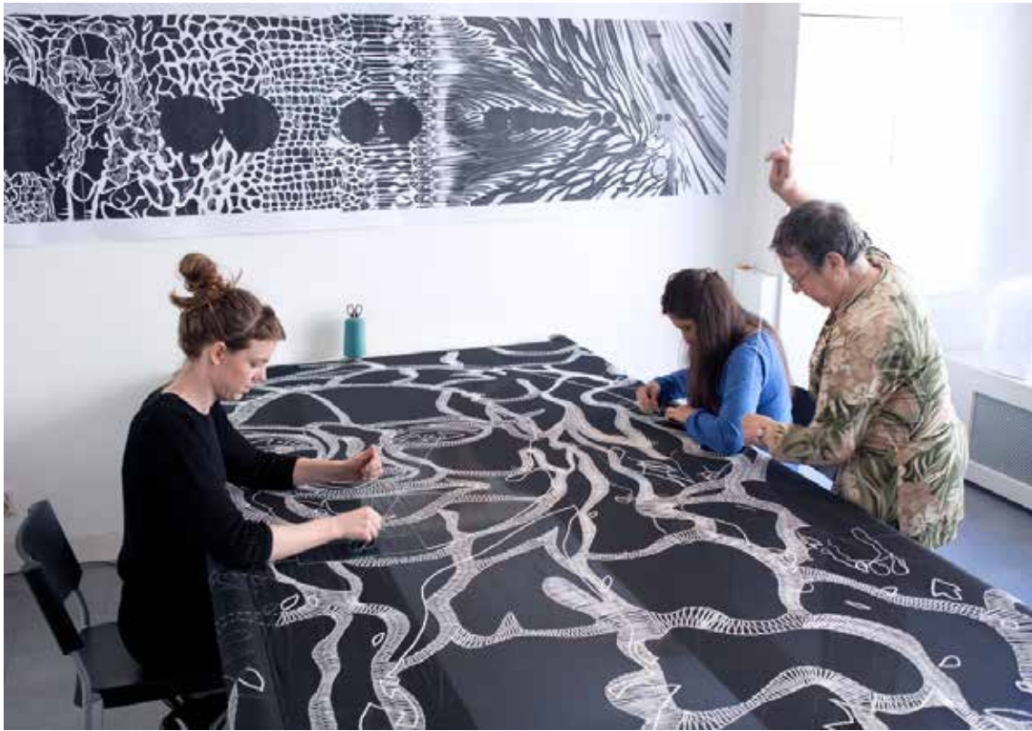
Fig. 3- Workshop Heden Hier contemporary art institute with the original design in the background.