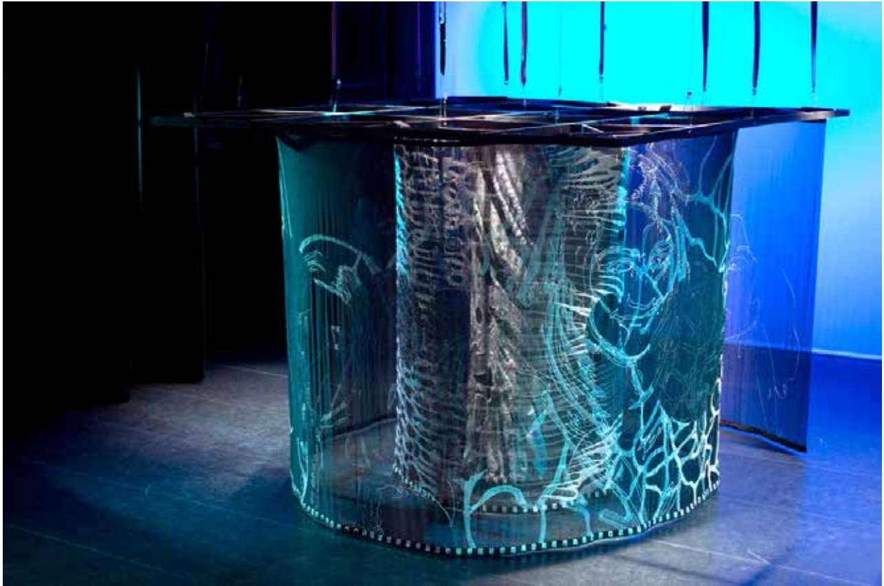
Fig. 1-: Sara Vrugt, Look at you 05, 2012, installation with embroidery, 400 cm.