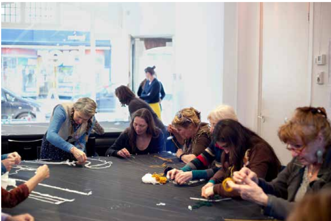
Fig. 4- Workshop at Heden Hier Contemporary Art Institute.