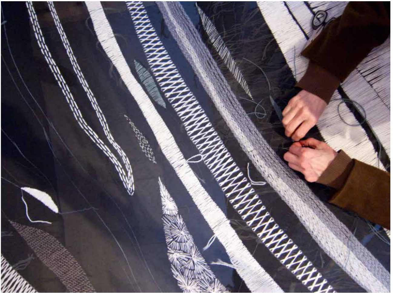
Fig. 2- Detail of the manufacturing.