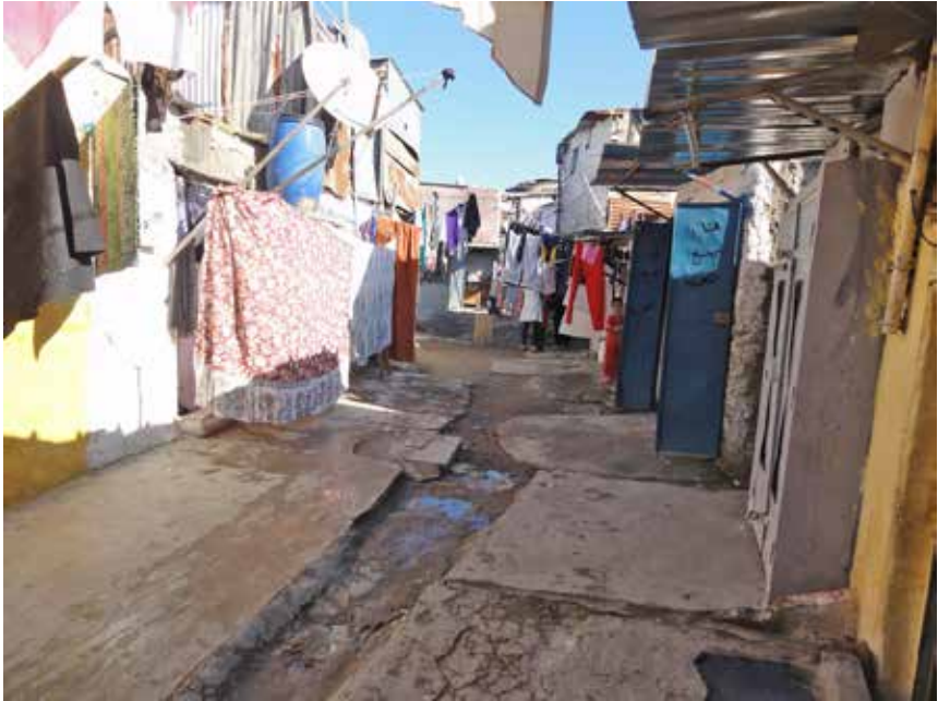
Figure 1.1 The Bidonville Er-Rhamna in Casablanca's District Sidi Moumen. Source: Author's photograph, December 2016.

While colonial powers initially turned a blind eye to bidonvilles, considering them as a way to evade their own responsibility to build houses for the working class, silent tolerance and neglect were temporarily suspended in reaction to rising tensions that threatened the “formal” parts of the city. Rachik (2002) has called this an urbanism of urgency ( urbanisme de l'urgence ), which began in the mid-1910s with the outbreak of a typhus epidemic in one bidonville. However, the logics of an urbanism of urgency have come to characterize governmental strategies toward marginalized settlements in Morocco and other North African countries until today (Beier, 2018). After the end of colonial rule, governments remained mostly ignorant toward bidonvilles, notwithstanding occasional incidences of social housing and sites-and-services projects. The latter—known in Morocco under the terms trames sanitaires and later recasement —is the most cost-effective strategy to replace informal neighborhoods and has today become the dominant policy option (Zaki, 2007). In sites-and-services projects, the state offers shantytown dwellers a serviced plot of land at a subsidized price and asks them to build their own house according to formal and predefined building standards.