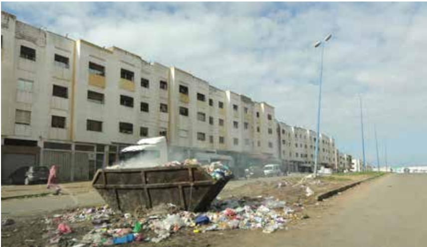
Figure 1.4 Open Waste Incineration in Nouvelle Lahraouiine. Source: Author's picture, November 2018.