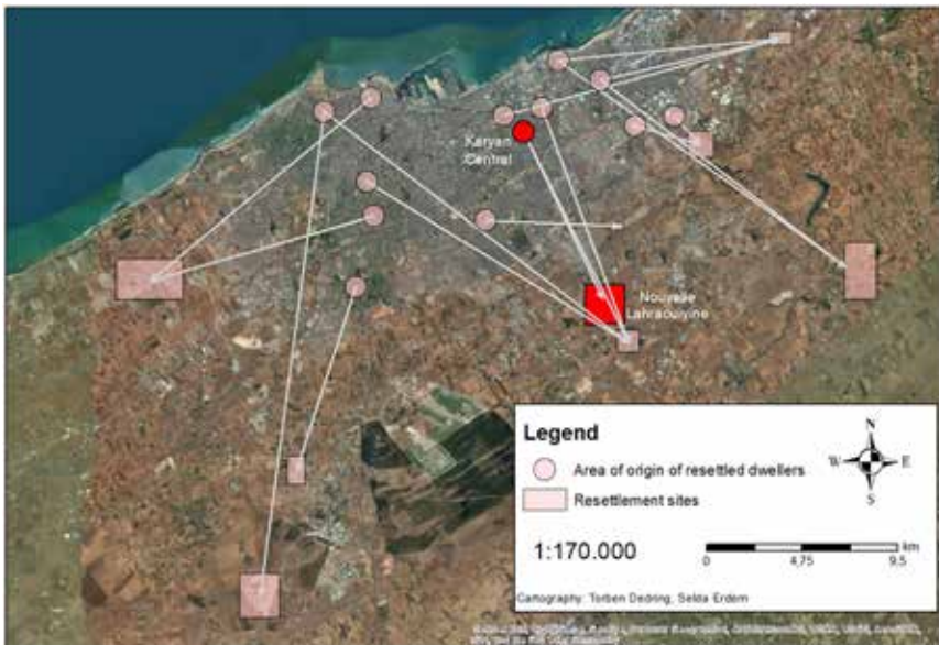
Figure 1.2 Map of Selected Displacements of Bidonville Dwellers in Casablanca Since 2004. Cartography: Selda Erdem and Torben Dedring.

After a short time of reflection under a reformist government at the end of the twentieth century, the 2003 suicide attacks in the city center of Casablanca, committed by several youth coming out of one of the city’s most disenfranchised bidonvilles, marked the next turning point of public policy and led to an increase in repression. Soon after this event, Mohammed VI launched the VSB program, seeking to eradicate all bidonvilles across Morocco (cf. Bogaert, 2011). Within the VSB program, a few initial attempts of in situ upgrading were quickly abandoned in favor of mostly sites-and-services but also subsidized housing projects (Zaki, 2013; figure 1.2). However, it would be wrong to understand the VSB program exclusively against the background of a resurgence of state control following political