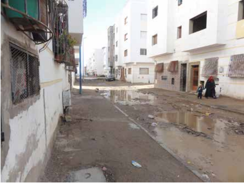
Figure 1.3 An Unfinished Street in Nouvelle Lahraouiine.