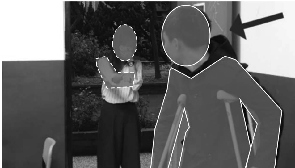
Fig. 1. An example last scene of video presentation. The areas within the white lines denote the four areas of interest used in the analyses (solid lines denoting the target person; dashed lines denoting the interaction partner). The white lines were not presented to the participants during the experiment.