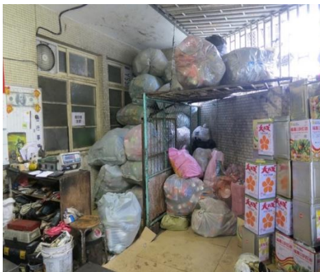
Figure 3.8 Neighbourhood junk shop (photo by the author, 2015)