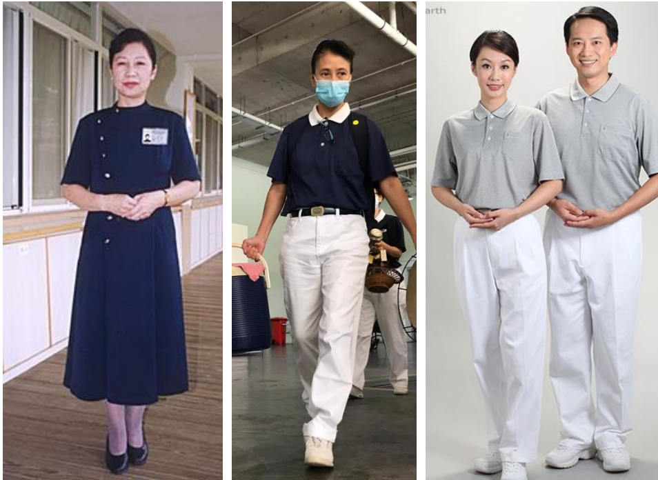
Figure 3.10 Tzu-chi volunteers and their uniforms (source: Tzu-chi official website 66 ; Da-ai Technology official website 67,68 )

In local congregations, there is a functional sub-unit ‘recycling group’ which makes up the largest share of Tzu-chi commissioners working at the recycling sites. These recycling commissioners are generally given the title ‘environmental admin’ (環保幹事 69 ) in the group category to which they belong in Tzu-chi’s hierarchical laity system. In particular, the environmental admins in the Unity and Harmony groups are referred to as the ‘environmental cadres’ (環保幹部 70 ). The