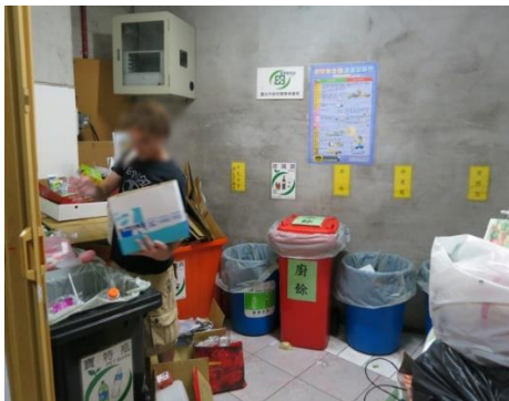
Figure 3.6 Community recycling room