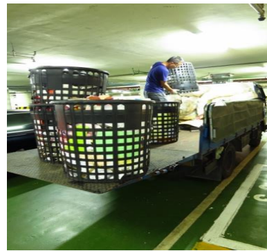
Figure 3.7 Van recycle