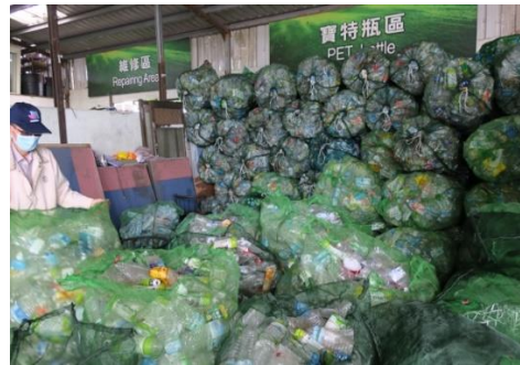
Figure 3.14 Sorted PET bottles in a Tzu-chi district station

Because recycling bases are mostly initiated locally, the majority of Tzu-chi recycling sites are not owned by the organisation. Particularly during the grass-roots phase of formation of the Tzu-chi recycling programme, there was little institutional intervention, and local residents or Tzu-chi associates often offered their trucks or land for recycling purposes. Only 50 out of the 279 Tzu-chi environmental stations are located on land owned by the Tzu-chi Foundation. These organisation-owned stations have often been developed into larger district stations, to which local congregational halls, the Jingsi Tang (靜思堂), relocate. The dependence on local spontaneity and social relationships, however, can lead to recurring problems with property ownership and usership, for example, because the previous owner of the property passed away, the social connections between the volunteers and donors eroded, or the capacity of the site cannot cope