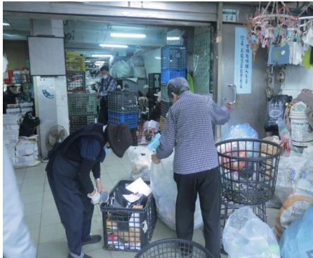
Figure 3.11 Tzu-chi community environmental station (photo by the author, 2016)