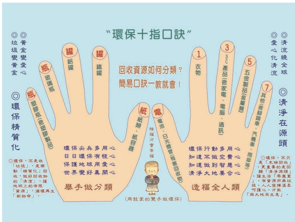
Figure 3. 15 A poster of the ‘pithy ten-finger environmental formula’

commander-in-chief and volunteers of each site ‘feel,’ but also the extent to which the volunteers are skilled and equipped. It depends on what waste the neighbourhood brings the recycling community, which again depends on the social networks of the recycling community members. The classifications also differ according to whether there is surplus holding space at the station, and whether the volunteers can find downstream recycling wholesaler buyers. The constant price fluctuations in the secondary material market can add another layer to the changeable situation. For instance, the number of recycling wholesalers in the Taipei region that are willing to purchase waste soft plastics between 2016 and 2018 dropped significantly due to the significant price drop in this material. As a result, in some smaller-sized Tzu-chi recycling stations, soft-plastic became ‘half-recycled’, meaning that while volunteers still collected the items from the general public and sorted them, the waste material items were transported to nearby, larger stations with surplus storage space to ‘sit and wait’ until the market could accommodate them again. In other words, waste classification in Tzu-chi is not determined externally and objectively; it is socially and locally embedded.