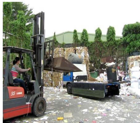
Figure 3.9 Crushing-baling depot

So far, this description shows that recycling has a long history and a well-formed industrial network in Taiwan, and it highlights the parallel stand of the Tzu-chi