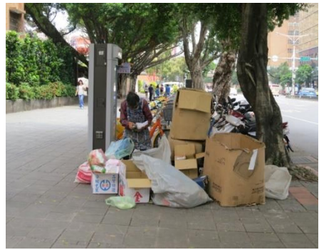
Figure 3.5 Scrap dealer (cart recycler) (photo by the author, 2016)