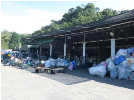
Figure 3.13 Tzu-chi environmental park