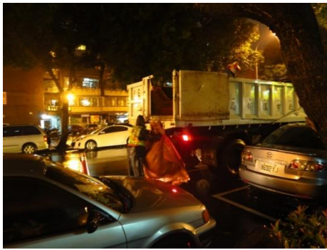
Figure 3.4 Municipal recycling truck