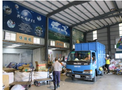
Figure 3.12 Tzu-chi district environmental station