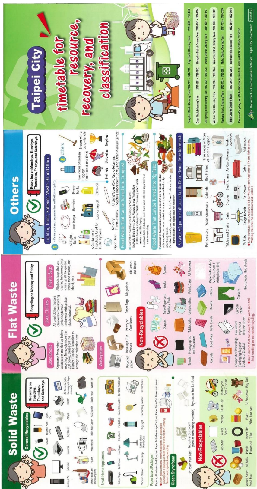
Figure 3.2 Recyclable Classification and Municipal Recycling Timetable of Taipei City (source: Taipei City Government)