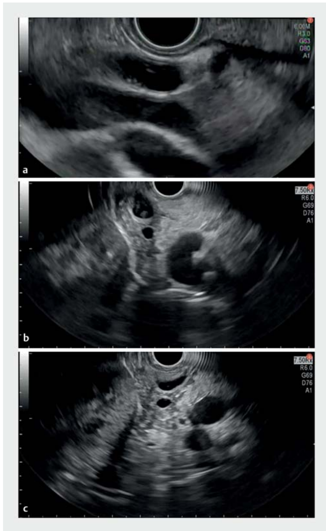
► Fig. 1 Images of evaluated EUS videos. Microlithiasis, sludge or artifact?

Secondary endpoints were the interobserver agreement on the need for ERC+ES (yes/no) and differences in interobserver agreement between experts and non-experts.