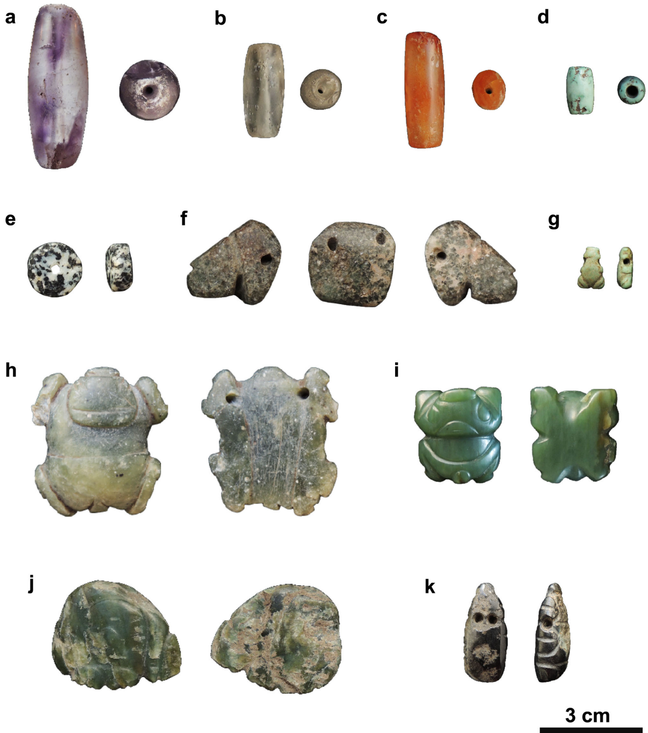
Fig. 2 Main raw material groups found in the studied collection: a amethyst, b quartz, c carnelian, d turquoise, e diorite, f other plutonic

rocks, g low temperature alteration products, h jadeitite, i nephrite, j metamorphic with tremolite, and k metamorphosed ultramafics".