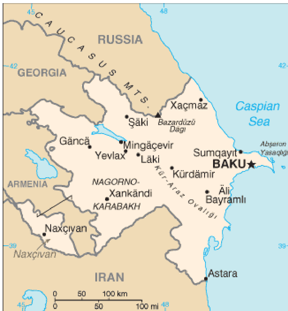
Map of Azerbaijan 76