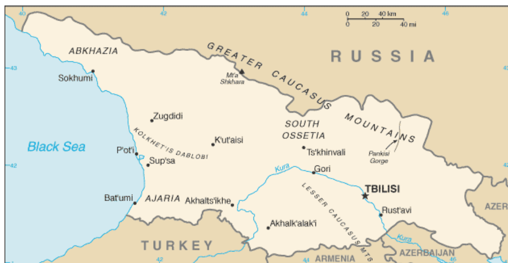
Map of Georgia 50