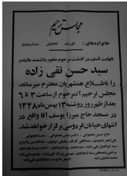
Figure 32: The announcement of Taqizadeh's death written by his family and friends in Tabriz (Tabriz Central Library).