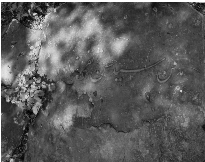
Figure 29: The original cracked and neglected gravestone of Taqizadeh