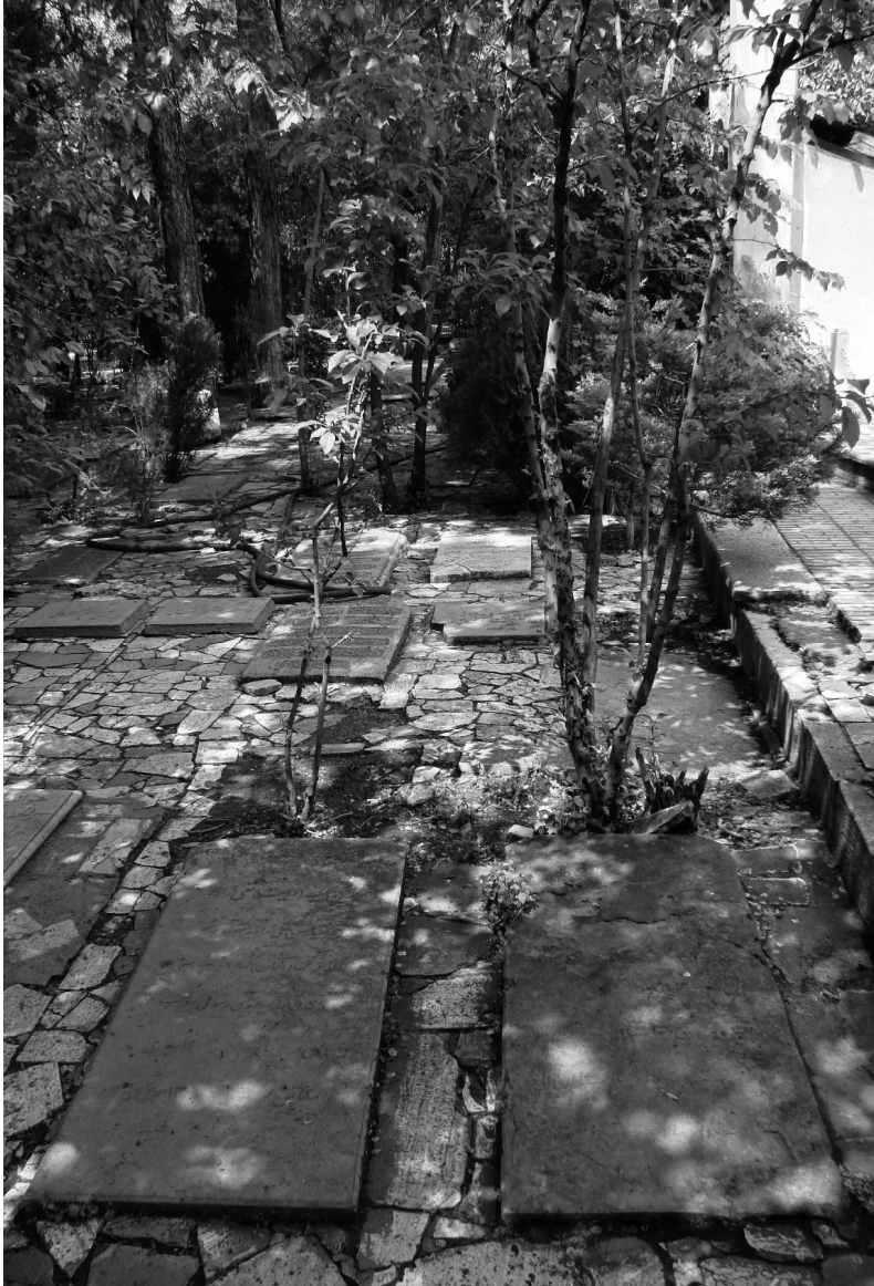
Figure 28: The original gravestones of Taqizadeh (right) and his wife (left) in Zahir al-Dowleh Cemetery in the north of Tehran. Though a gravestone of his wife lies here, her body is in fact buried in Bournemouth, UK.