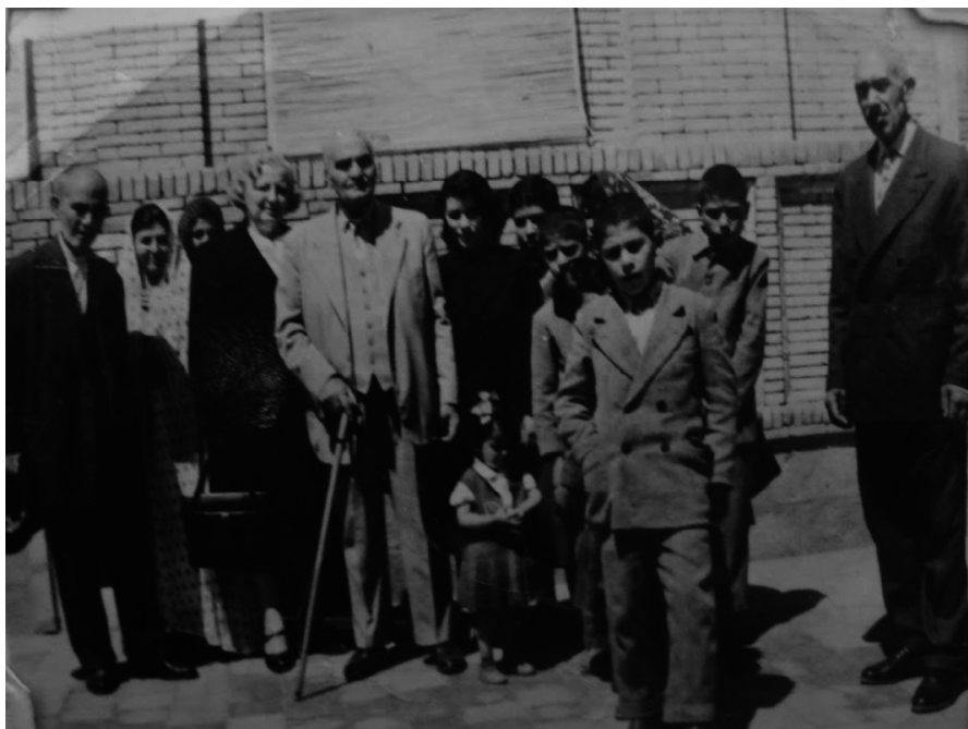
Figure 27: Taqizadeh (centre with cane) with his wife and other family members, courtesy of one of Taqizadeh's brother's family.

The ailing Taqizadeh had problems with his knees and towards the end of his life was confined to a wheelchair. He rarely complained about his situation and continued his routine of studying and research. However, as one of his acquaintance's recalls, towards the end of his life he had once tried to lift himself out of the wheelchair but realising he was unable to manage that, had expressed his wish to die and asked God for release. 1400