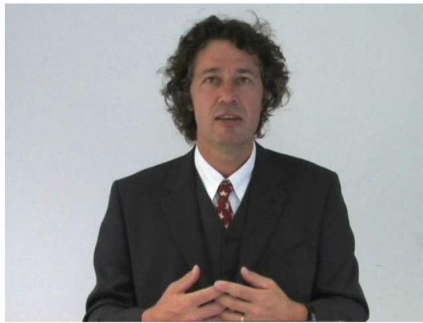
Figure 4.1: Screenshot of the speaker delivering the presentation (representative of all four presentation versions used)

The two presentations (CT/NB) were delivered by an experienced speaker (a lecturer/coach in oral presentation skills) and were recorded against a neutral white background. The speaker alternately looked at a printed text in front of him and at an improvised autocue (a projection screen behind the camera). The presentation was not accompanied by slides; these were believed to create the unintentional effect of emphasising the transitions. The recordings were digitally edited; the only difference between the 0 and 1 versions of the presentations was the inclusion of a few lines at the beginning of the concluding section of the 1 versions (with concluding techniques; see italicised text in table 4.1). The recordings differed some seconds in length: the CT0-version had a length of 17:59 minutes, the CT1-version of 18:13 minutes, the NB0-version of 14:53 minutes and the NB1-version of 15:05 minutes. Figure 4.1 shows a screenshot of the recordings. The recording files can be found in Appendix C.2.