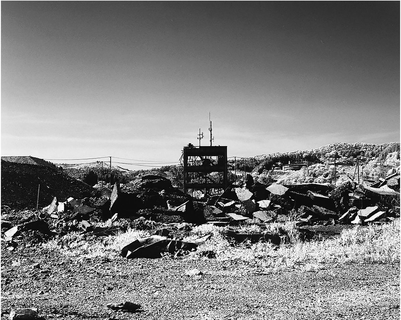
Figure 1. The ruins of the Disaster Prevention Center in the town of Minamisanriku, Japan, 2015.

down the river next to the center, he realized that the tsunami was bigger than expected. He ordered everyone to the roof. As he ascended, Satō saw a cloud of yellow dust rising from the direction of the sea. Suddenly, the adjacent town hall broke apart and smashed into the center. Water cascaded over the roof, hurling him into the emergency staircase.