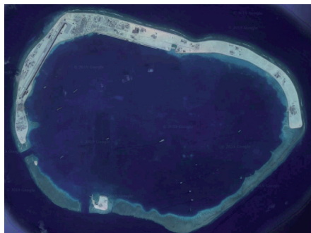
Figure 3.2: Satellite image of Mischief Reef in 2019

The fact that the destruction of the reef as a result of the construction atop it was in breach of environmental protection laws, as mentioned in Section 3.2.2, illustrates that States do not have an unfettered right to employ these construction methods. In this way, international airspace may be indirectly protected from jurisdictional claims by States in connection with this type of use of natural features – namely, that which is destructive to the natural environment and that is irreversible – by prohibiting the construction from the outset. This does not exclude construction on low-tide elevations in general though, for example for use as a base for the construction of reversible artificial islands, i.e. with less environmental impact, or for installations or structures which are, as explained in Section 3.2.1.2, generally less invasive.