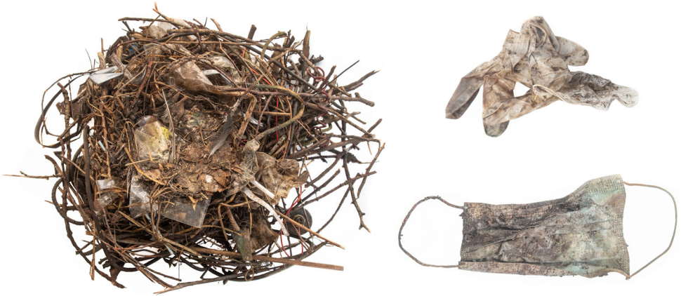
Figure 3. Nest of common coot ( Fulica atra ) partly built with face mask (GW9792-3) and glove (GW9792-4). Nest located at the Beestenmarkt, Leiden, The Netherlands, collected on the 6th of September 2020.

Our observations may have been the first Dutch cases, yet the first reported victim of COVID-19 litter globally, to our knowledge, was an American robin ( Turdus migratorius ; Denisuk, 2020). This bird appears to have died after becoming entangled in a face mask at Chilliwack, BC, Canada, on the 10th of April 2020 (pers. comm. Sandra Denisuk; fig. 4). After that, a young gull ( Larus sp.) was found walking with a face mask tangled around its legs in Chelmsford, Essex, UK (RSPCA Essex South, 2020). It had struggled with the mask for two weeks and its limbs and