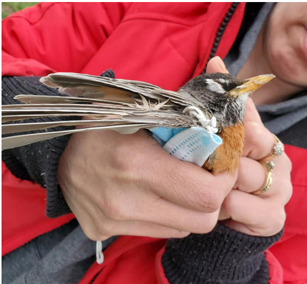
Figure 4. First victim of COVID-19 litter, an American robin ( Turdus migratorius ) entangled in a face mask at Chilliwack, BC, Canada on the 10th of April 2020.

Our observations may have been the first Dutch cases, yet the first reported victim of COVID-19 litter globally, to our knowledge, was an American robin ( Turdus migratorius ; Denisuk, 2020). This bird appears to have died after becoming entangled in a face mask at Chilliwack, BC, Canada, on the 10th of April 2020 (pers. comm. Sandra Denisuk; fig. 4). After that, a young gull ( Larus sp.) was found walking with a face mask tangled around its legs in Chelmsford, Essex, UK (RSPCA Essex South, 2020). It had struggled with the mask for two weeks and its limbs and