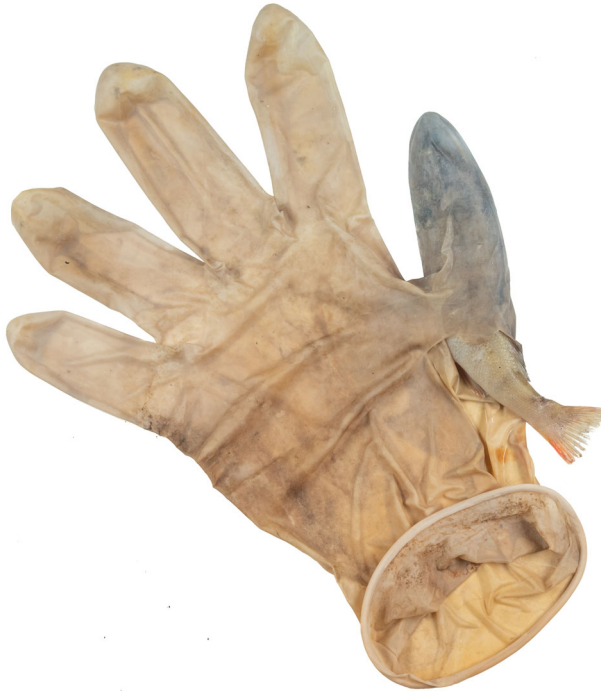
Figure 2. An entrapped perch ( Perca fluviatilis ) in a PPE glove (GW9899-1E), found during a Plastic Spotter clean-up in the canals of Leiden, The Netherlands.

that plastic litter also impacts the lesser-studied freshwater ecosystems and that the new wave of PPE latex gloves littering our environment could make entrapments like these more frequent in the future.