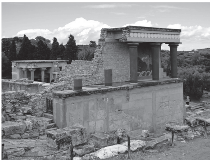
Fig. 1: Photograph showing a small, reconstructed and refurbished segment of the expansive palace of Knossos on Crete.

islands in the Mediterranean. Crete's geographic position in the Mediterranean allowed for its control of trade in the region and it became a dominant maritime power with important harbors and a large fleet of seaworthy ships.