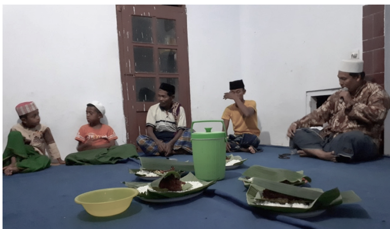
Figure 3.2. Traditional way of celebrating a birthday which is calculated on the basis of Islamic lunar calendar. The ceremony involves recitation of Quranic chapters, led by a religious leader.

Beatty remarks that all rituals reflect the interests of orthodoxy in creating social harmony in the neighbourhood by recommending adjusting one's behaviour to unorthodox others. 62