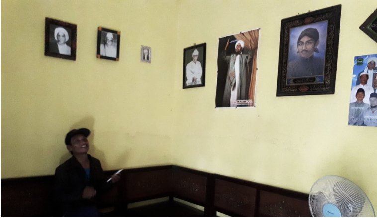
Figure 3.3. Each family adopts its own respected kyai whose photos are commonly hung on the wall in the front room.