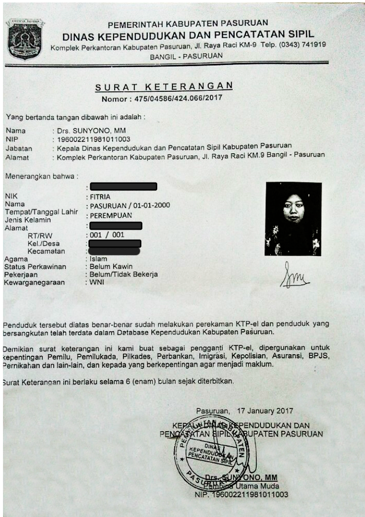
Figure 2.4. Letter from the local bureau of civil administration, substituting identity cards

Secondly, when the bride is not legally allowed to register her marriage, primarily because her age is under 16 on the day of the marriage ceremony, the modin usually marry a couple informally for social reasons and postpones the registration. This means that one consequence of the modernization of the marriage registration system