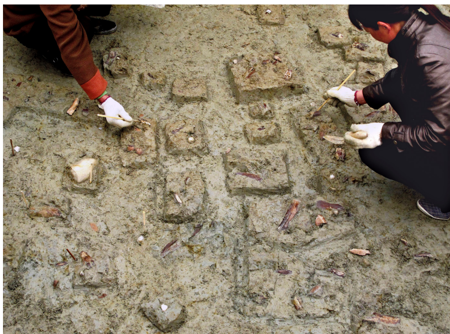
Figure 2: The 2011 excavation at Lingjing (Xuchang, Henan, China): Layer 11, Trench 11.

Two fragmented, incomplete human skulls (Xuchang 1 and Xuchang 2) were excavated in Layer 11, in situ between 2007 and 2014 (Li et al. 2017a; Trinkhaus and Wu 2017). Xuchang 1 (26 pieces) is the most complete; it retains most of the neurocranial vault and portions of the cranial base, as well as part of the left frontal bone. Xuchang 2 (16 pieces) is less complete with large part of the occipital bone and the temporal bones (see Li et al. 2017a). The Xuchang Man skulls derive from young adults and exhibit a mosaic of morphological features with differences from and similarities with their western contemporaries, which suggests complex dynamics between Eastern and Western Eurasian populations at the time. Given their low and broad neurocrania with the maximum breadth inferiorly, they are considered as eastern Eurasian late archaic hominins (Li et al. 2017a; Trinkhaus and Wu 2017). Both skulls exhibit external auditory exostoses most pronounced in Xuchang 2 implying conductive hearing loss (Trinkhaus and Wu 2017).