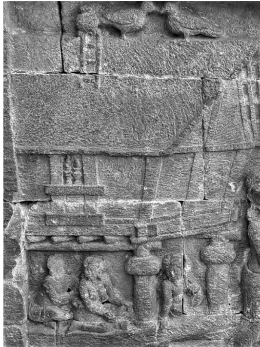
Figure III.2. A house depicted in a relief on the north side of the first gallery of Borobudur, Central Java, mid-ninth century. Note the bulbous tops of the piles intended to prevent ingress of vermin (cf. Chen 1968:284-285). Author's photograph, November 2018.

Tomé Pires says, describing the palace of the king of Sunda: