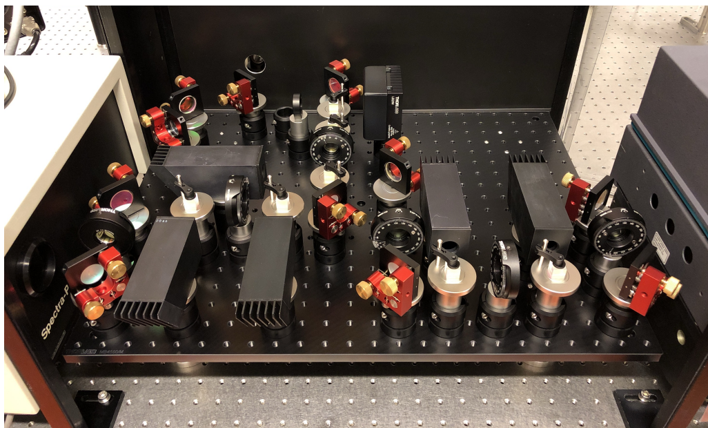
Photo 1: The pulsed high power optical set-up used to generate the transient toroidal helium plasmas studied in this work. On the left, the Quanta-Ray GCR-3 Q-switched Nd:YAG laser is visible, capable of generating high power 10 ns laser pulses with a wavelength of 1064 nm and with energies up to 275 mJ. On the right, the Continuum NY61-10 laser is visible, similarly capable of generating laser pulses with energies up to 300 mJ. At the top of the photo, a circular aperture is visible in the black aluminium plate, through which the high power laser pulses are guided on their way into the plasma reactor. The dimensions of the breadboard on which the optical set-up has been built is 600 x 450 mm in size. This photo is referenced on page 15 and in figure 2.2.

To give a more vivid impression of the research presented in this dissertation, we present photographs of selected experimental set-ups used for this research. References are given to the research in this dissertation to which these photos relate.