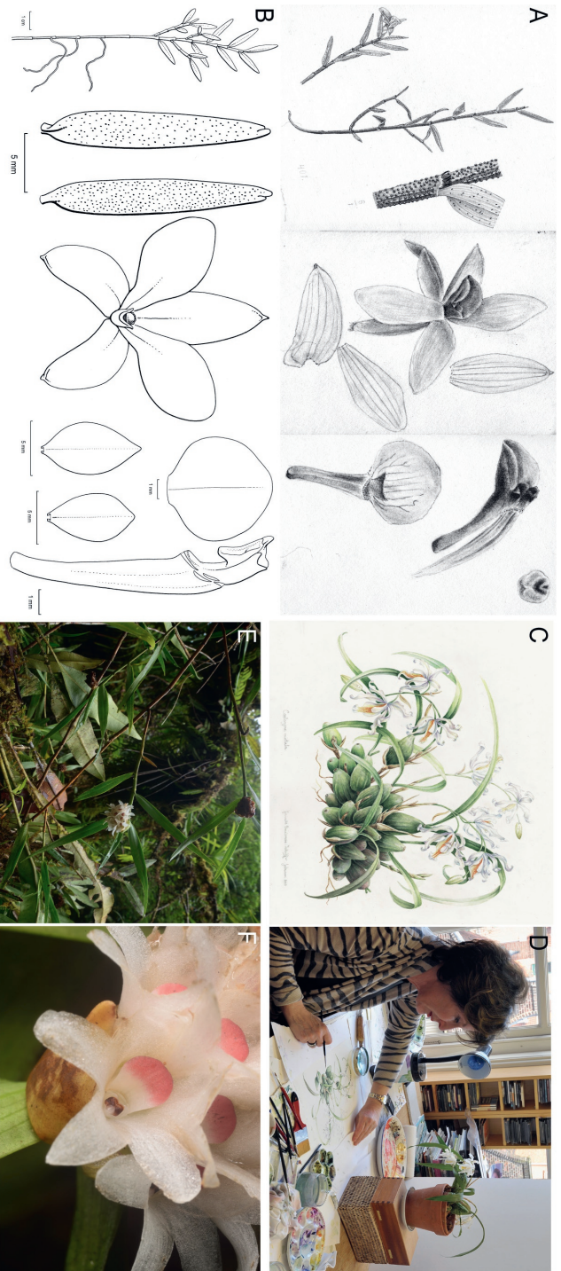
Figure 1.4. An impression of illustrations of Necklace orchids made over the past two centuries. A. Black and white pencil drawing of Glomera amboinensis made by Johannes Jacobus Smith to illustrate species descriptions in his publication in the journal Bulletin du Département de l'Agriculture aux Indes Néerlandaises . B. Scientific illustration of key diagnostic characters of G. amboinensis made by Esmée Winkel for a publication in the journal Phytotekes . C. Artistic botanical drawing of Coelogyne cristata made by Janneke Brinkman in 2013 for use in commercial products. D. Photograph of Janneke, making the drawing displayed under C. E-F. Photographs of Glomera montana in the wild in the Solomon Islands.