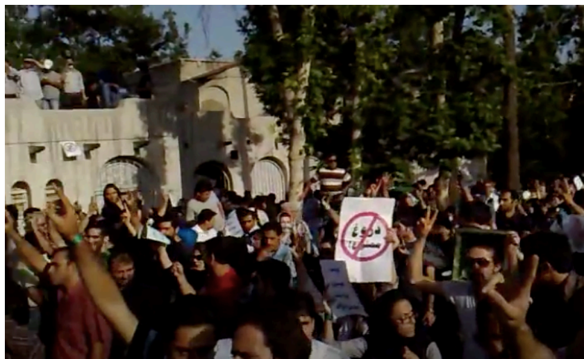
Tehran, June 16, 2009. “Lies are forbidden” (photo from a video) 774

This accusation showed that the Iranians flooding into the streets were conscious that their discontent went beyond the mere mistrust of the IRI’s system. The slogan was chanted while the crowd was walking close to the national television building. It represented a retort to the Islamic Republic of Iran Broadcasting (IRIB)’s coverage of the protests that dismissed the Green Movement, deeming it a group of “losers,” “rioters,” and “thugs.” It also revealed an almost total lack of fear of directly addressing and naming the perceived enemy, as another placard communicated: “Ahmadi is not my president.” Interestingly, this last sign was in English, as the Greens were aware that the world was observing them. They were walking on the brink, staging a public contestation, daringly interacting with Ahmadinejad. During a rally in Tehran’s Vali Asr Square on Sunday 14, Ahmadinejad labeled the disappointed protesters as khas o khāshāk [dirt and dust.] Talking to his supporters, he stated: “The nation’s huge river leaves no room for the expression of dirt and dust.” Hence, once again, Mousavi’s supporters expressed their dissent using slogans dialogically. As a direct response to the proclaimed president, they took a new catchphrase to the streets Khas o khāshāk to-I [You are dirt and dust.] 775 A huge banner appeared in the first