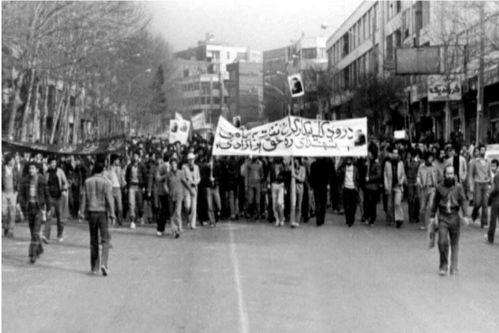
Oil workers, February 1979