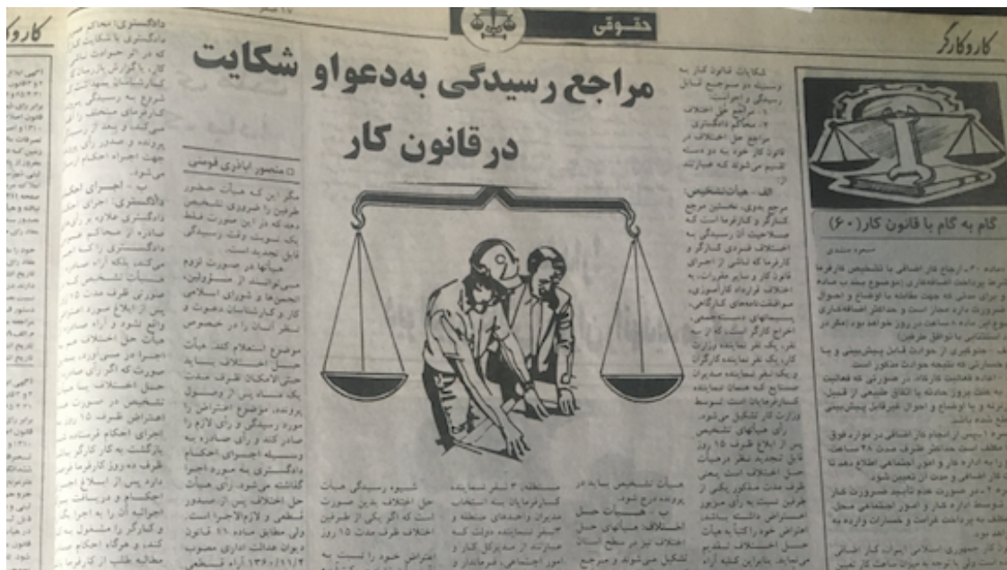
Disputes over the Labor Law discussed in Kār-o-Kārgar (May 2000-Khordād 1379).