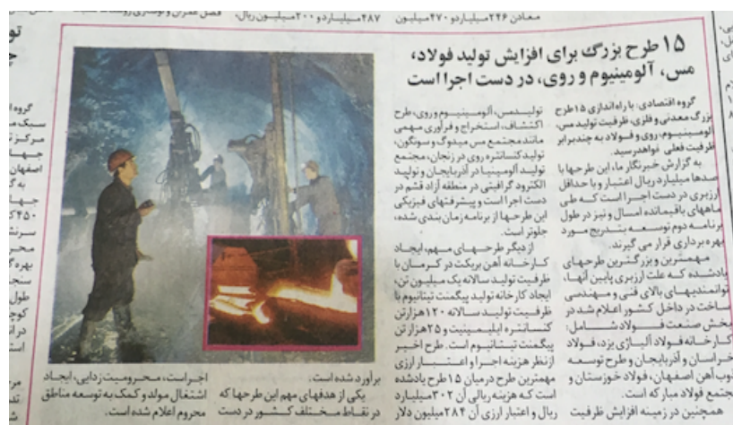
“15 large-scale projects to increase the production of steel, copper, aluminum and zinc” ( Hamshahri , 1375-1996)

belongs to them.” Likewise – he added – they need to be educated because “this increase in education will raise production.” 614