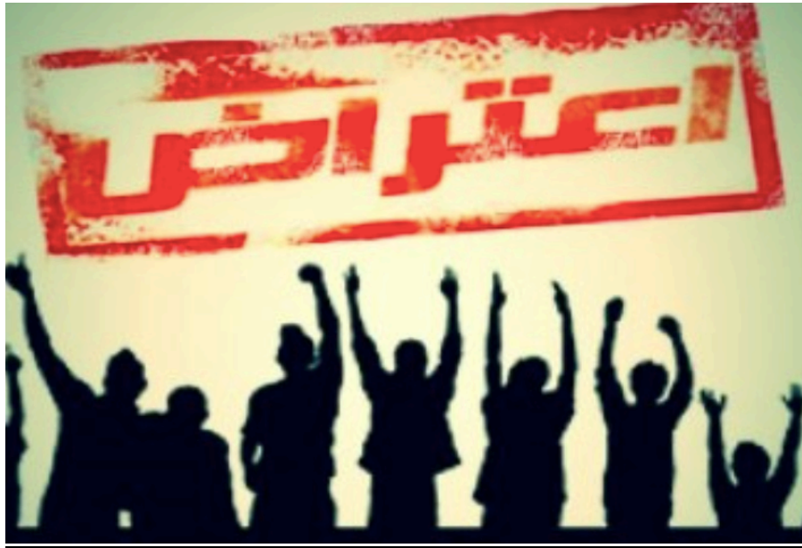
"E 'teraz" [protest]