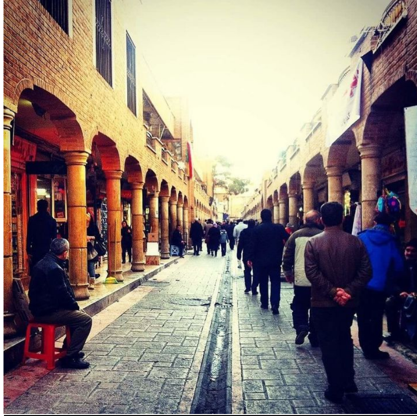
Tehran, 2018.