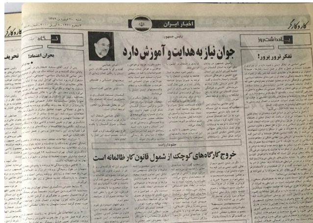
Kār-o-Kārgar , 6 April 2000, (18 Farvardin 1379).

“Young people need guidance and education.” 705 Lower down on the page, a statement attributed to Jelodarzadeh, read: “The removal of small workshops from the Labor Law is cruel.”