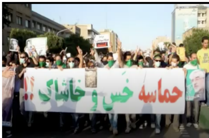
Tehran June 18, 2009. “Epic of dirt and dust” 776

week of protests: “The Epic of dirt and dust.” The expression became iconic, as ironic jokes pervaded the comments sections of news posts on the web. The newspaper E'temād published pictures of the demonstrators carrying the banner on its front page.