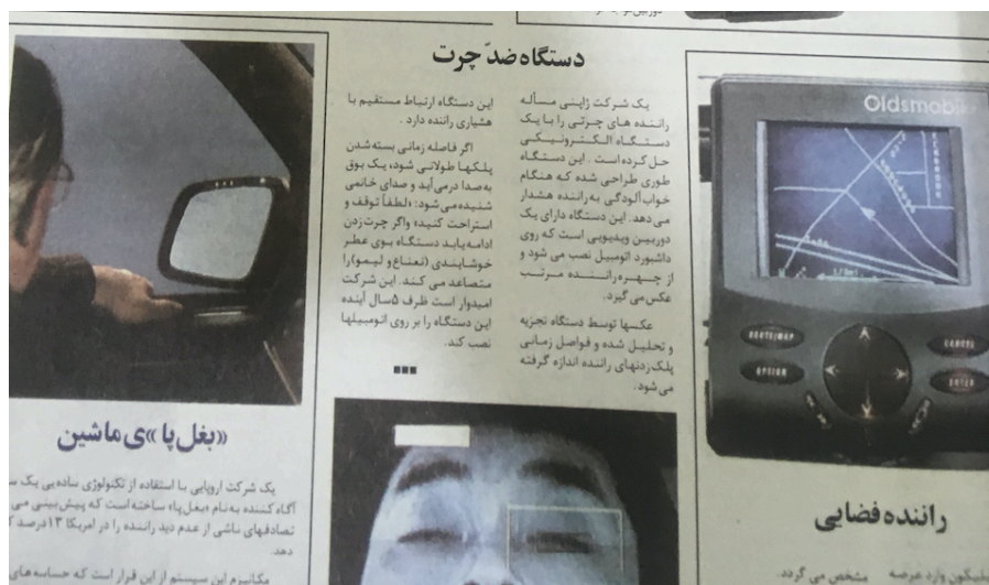
New sensors against accidents, a special Japanese device against falling asleep while driving and GPS technology (Iran, 1374-1995)

sold as classy or luxury ( ba kelās, luksī ), therefore, embodied the myth of those who dare. Consequently, aspiration began to represent a sort of sine-qua-non condition in the process of creating the ideal neoliberal citizen, who should be continuously committed to self-improvement.