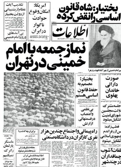
Ettelā'āt , 1 Bahman 1357, 21 January 1979.

They had no intention of ceasing their strikes and demonstrations, believing that their fight was a tool with which they could reach the main goal: freedom. By identifying workers' struggle with the act of giving "blood for free," the Sāndikā-ye-moshtarak-e kārgarān-e naft presented the path towards freedom and a lack of corruption as a route of sacrifice, evoking the imagery of martyrdom that permeated Khomeini's rhetoric. A week before the Revolution was finally accomplished [February 11, 1979 - 22 Bahman according the Persian calendar], they issued the following statement: