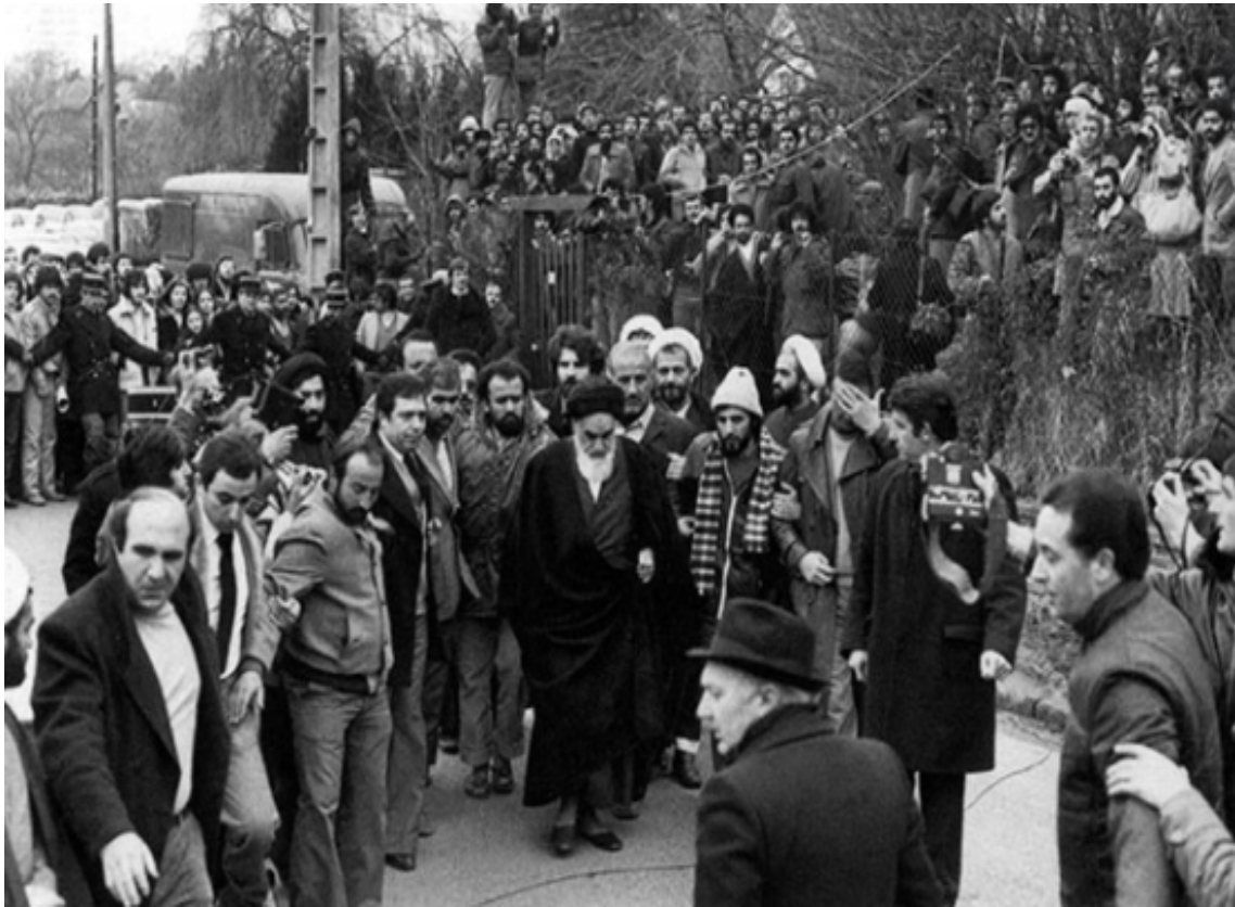
Ayatollah Ruhollah Khomeini in Neauphle-le-Château, 1978.