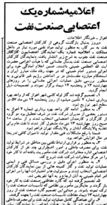
Ettelā'āt , 17 Dey 1357, January 7, 1978

at the bottom of page 4 by Ettelā'āt . Titled “The first statement of the striking oil industry,” 315 it granted full support to Khomeini.