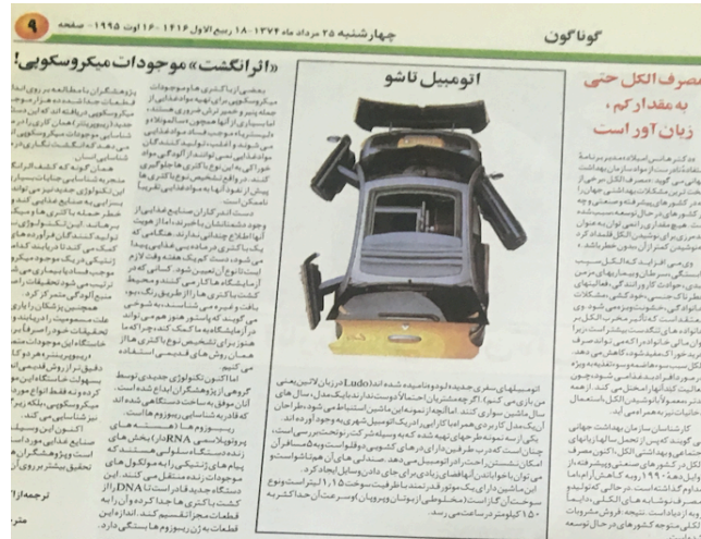
A smart and foldable car called Ludo ( Iran , 1374-1995)

billion dollars. Furthermore, feeding the consumer generation through the praise of technology operated as a means-goal to galvanize the population and make them participate in the national endeavor of the toulid va masraf mantra. The new sections for technology and state-of-the-art products in Iran for example, as well as the growing advertisement section in Hamshahri , from the 1990s onwards represented a step in this direction.