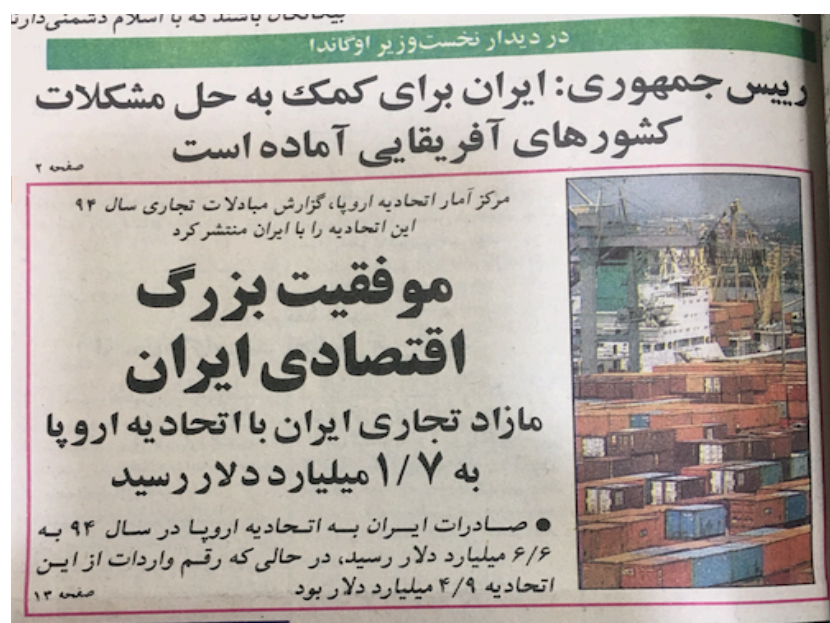
“Big successes for Iran’s economy” ( Iran , 1374-1995)