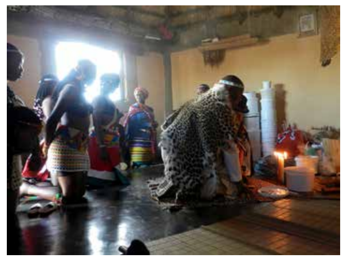
Figure 3.10 Start of the healing session

In front of Mr Mbele is a white bucket, wrapped in a white cloth; on top of this bucket's lid are about fifteen silver coins. Mks Zinhle sticks five candles (blue, red, yellow, white, and green) to the floor and then she puts an ibhayi around her shoulders; she is ready to start this part of the session. She does so by lighting the yellow candle and the imphepo , then she invites Mks Dudu to light the green candle, Mks Gasa to light the blue one, and Mr Mbele himself to light the red and, ultimately, the white one. For each candle they use a separate match, which, after the candle is lit, is extinguished and thrown in the silver dish with the smouldering imphepo .