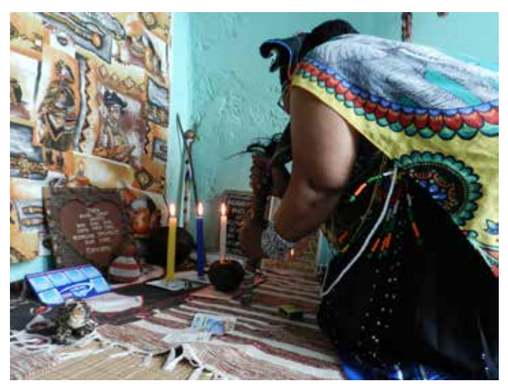
Figure 3.2 Mks Mbuyisa burning essence

additionally use snuff<sup>13</sup> or a herb<sup>14</sup> to quickly connect with the ancestors or to intensify the communication.