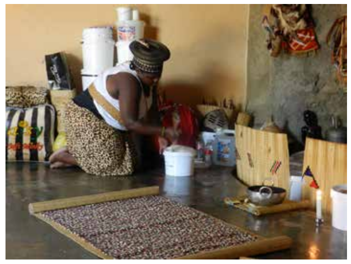
Figure 3.3 Stirring the muthi

Eating the foam of stirred muthis is also known to be a frequent (if not daily) early morning practice for students as a part of their training to become sangomas. In that case it is used as an emetic, to purify the body, and, consequently, making the student more open to the ancestors' messages during the day to come. Mks Ngidi told us that there are at least three different sorts of muthis for different kinds of ancestors: indiki ; indawe ; and thumwe .